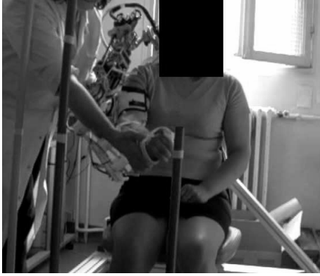
Fig. 4. Arm manipulation of an hemiplegic patient by a physical therapist and an upper-limb robotic exoskeleton, performed at the Raymon Poincaré Hospital, Garches, France. Such tasks require a complex sensorimotor coordination strategy between the physiotherapist and the training patient.

human worker action), cannot be considered slaves because no information exchange is needed, as the worker and robot complete separate actions.