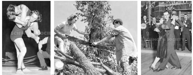
Fig. 1. Wrestling, sawing, dancing involve specific roles for the two partners

Recent years have seen the appearance of ‘assistive robots’, including assistive devices for manufacturing [Akella et al., 1999], [Schraft et al., 2005], robotic systems for teleoperation [Hokayem and Spong, 2006], assisted driving systems increasingly included in cars [Gietelink et al., 2006], robotic wheelchairs to increase the mobility of people with physical or cognitive deficits [Zeng et al., 2009], workstations with haptic feedback that can be used to train surgeons [Nudehi et al., 2005], robotic exoskeletons to increase the user’s force capabilities [Kazerooni, 1990], and rehabilitation robots to increase the amount and intensity of physical therapy after stroke [Kwakkel et al., 2008].