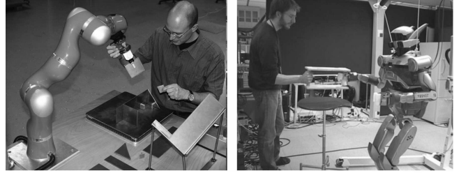
Fig. 2. Human-Robot joint motor action. Left: LWR robot from DLR. Right: HRP2 robot used in [Evrard and Kheddar, 2009a].

(as reviewed in [Passenberg et al., 2010]) which are based on simple fixed asymmetric role distributions between human and robot.