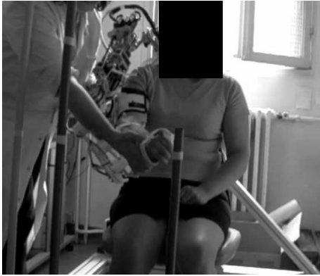
Fig. 4. Arm manipulation of an hemiplegic patient by a physical therapist and an upper-limb robotic exoskeleton, performed at the Raymon Poincaré Hospital, Garches, France. Such tasks require a complex sensorimotor coordination strategy between the physiotherapist and the training patient.

human worker action), cannot be considered slaves because no information exchange is needed, as the worker and robot complete separate actions.