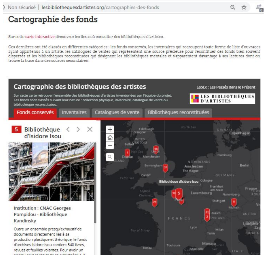
Figure 4. Map of artist libraries on www.lesbibliothequesdartistes.org

Bibliothèque Kandinsky – Centre Georges Pompidou in Paris. The libraries are classified by types (material founds, reconstituted, from inventory or sales catalogs). Thanks to the various tools (the plug-in) it offers, Omeka is a very adaptable CMS that can support these different goals. Alongside the database and its connected visualization tools, the project functions as an entire website.