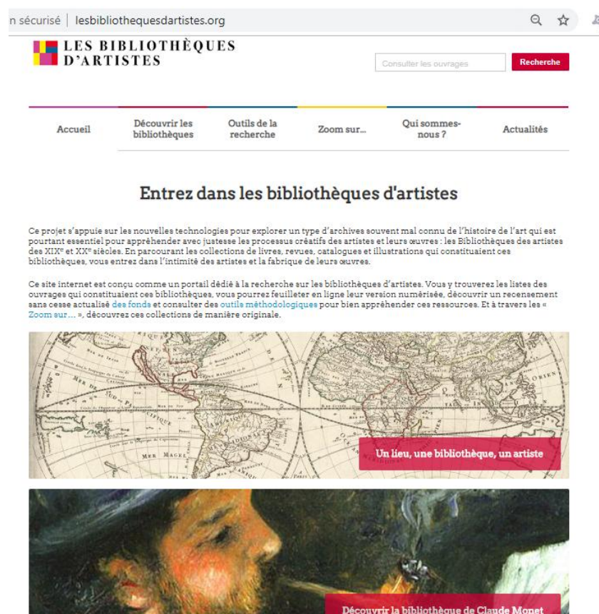
Figure 1. Home page of www.lesbibliothequesdartistes.org