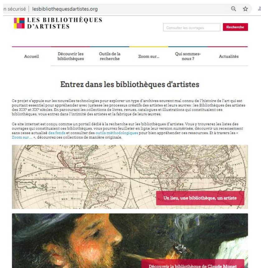
Figure 1. Home page of www.lesbibliothequesdartistes.org