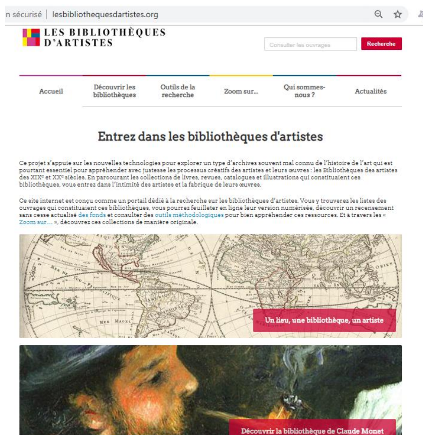
Figure 1. Home page of www.lesbibliothequesdartistes.org