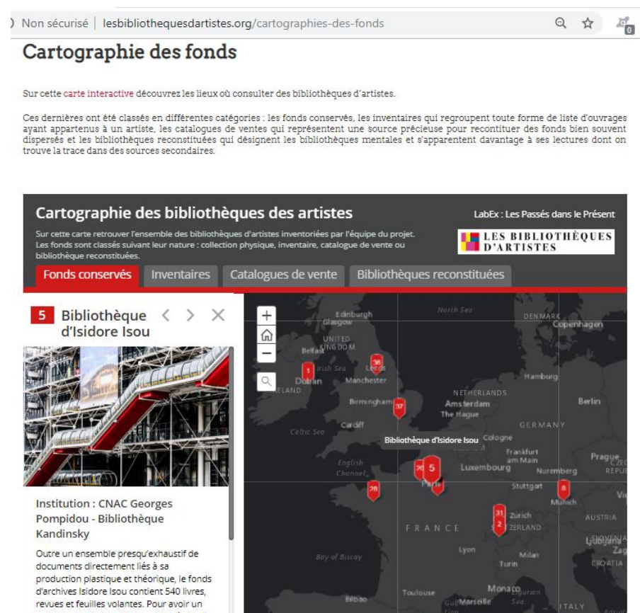
Figure 4. Map of artist libraries on www.lesbibliothequesdartistes.org

where it is kept. That's why there are sometimes several libraries on one point, for example at Bibliothèque Kandinsky – Centre Georges Pompidou in Paris. The libraries are classified by types (material founds, reconstituted, from inventory or sales catalogs). Thanks to the various tools (the plug-in) it offers, Omeka is a very adaptable CMS that can support these different goals. Alongside the database and its connected visualization tools, the project functions as an entire website.