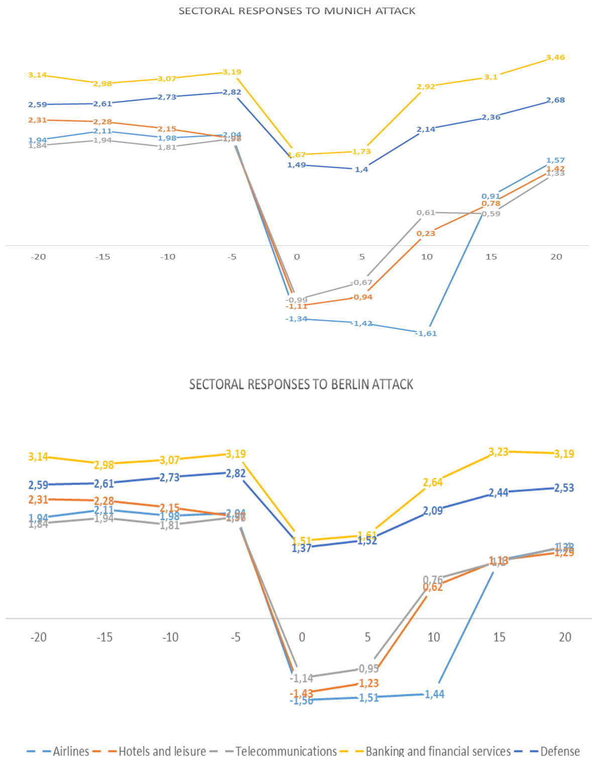
Figure 2. The cumulative abnormal returns of sectoral German stock market in response to terror attacks over an expanded event window after accounting for further control variables

Besides, the changes in the short-term systematic risk following the 2016 Munich and Berlin attacks by sector remain robust after adding further control variables (in particular, VDax and Gold ). Table 4 summarizes the results for Munich and Berlin attacks (Panels A and B,