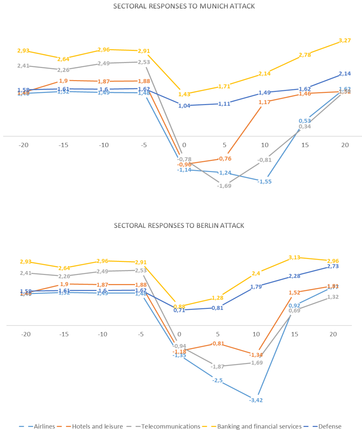
Figure 1. The cumulative abnormal returns of sectoral German stock market in response to terror attacks over an expanded event window

Table 2 display the changes in the short-run systematic risk by industry after Berlin and Munich terror attacks (Panels A and B, respectively). Our findings reveal that the terrorist attack has yielded to a notable rise in systematic risk for the majority of industries under study, particularly for airlines, hotels and leisure and telecommunications. Following the Berlin attack,