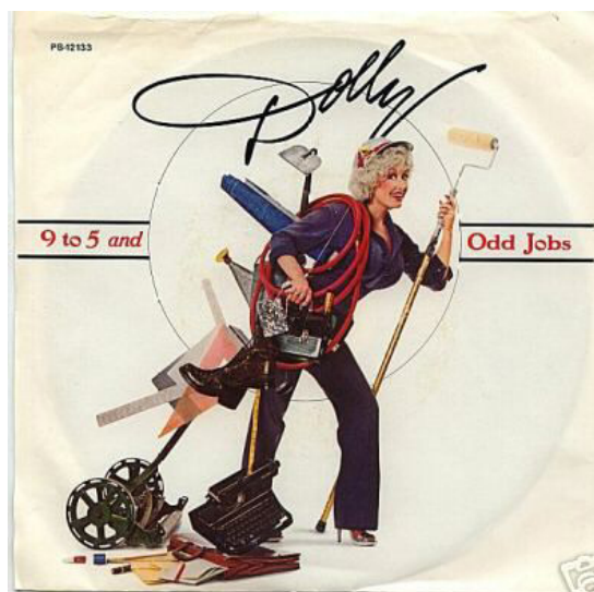
Cover art of 9 to 5 and Odd Jobs (1980)