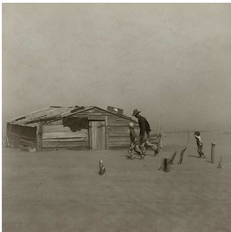
© Arthur Rothstein ( Dust Storm , 1936)

The following photograph of Arthur Rothstein represents an iconic image of Great Depression Era and Dust Bowl (see below).