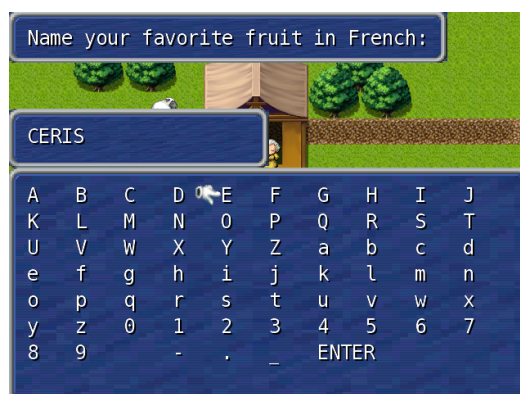
Figure 3: Example of data collection.

We do not a priori possess much resources for the UL beforehand, and because the non standardized language can present spelling variants, the game is not aimed at providing feedback to the player over the correctness of the resources they provide. Yet, the tasks must be designed to avoid malicious behavior such as entering random strings instead of providing valid linguistic resources. This control can be performed thanks to various mechanisms, for instance with the use of a small size lexicon that serves as