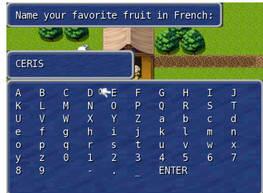
Figure 3: Example of data collection.

We do not a priori possess much resources for the UL beforehand, and because the non standardized language can present spelling variants, the game is not aimed at providing feedback to the player over the correctness of the resources they provide. Yet, the tasks must be designed to avoid malicious behavior such as entering random strings instead of providing valid linguistic resources. This control can be performed thanks to various mechanisms, for instance with the use of a small size lexicon that serves as