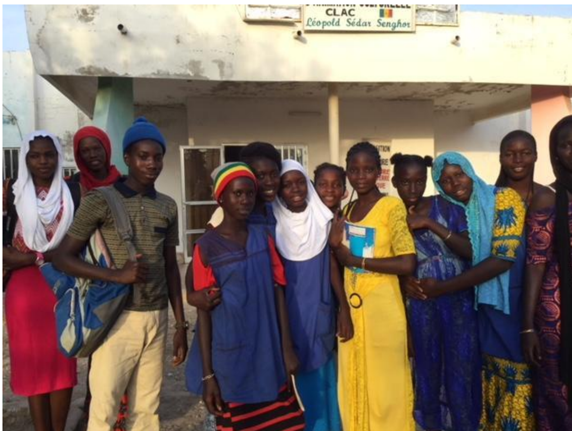
After the oral survey, students from the CEM Lamine Senghor in front of the Centre de Lecture et d'Animation Culturelle, CLAC Léopold Sédar Senghor, Joal-Fadiouth, Senegal, December 2017.

The junior high school students appeared to be more engaged in a wide-ranging exploration of all kinds of recreational literature and were reading for pleasure at an earlier age than their AIMS counterparts. It is plausible that the combined effort of the school prefect and the village librarian (who lives onsite, visits his family only once a week in order to keep the CLAC open almost 24/7, attends football games to reach out to supporters and convince them to visit the CLAC) are paying off in terms of creating a culture of reading. Another middle school in the village has an on-site library supported by a privately funded network of French librarians, but we were not able to visit it, and there is little to no cooperation between the two schools nor exchanges of resources. The CLAC is supported by the Organisation Internationale de la Francophonie (OIF), 108 but the librarian does not have sufficient training to make proper use of the educational material, the material books on offer are limited in quantity, and most are worn out due to intensive use and insufficient renewal of the collection.