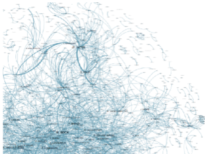
Figure 4: Automatic document linking and visualization

<38> In this framework, each dimension of a TF-IDF vector, \vec{v} , stands for a word: dimension i is for the i^{th} word in the vocabulary V , denoted w_i . For each textual document, d , in the database, D (the database can be an archive), a TF-IDF vector, \vec{v}(d) , can be computed.