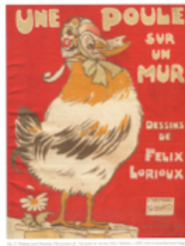
Figure 1: 1920 children's book illustration

[14] As stated by D.Poulot in,[7] cultural heritage is linked to the representation of values forged by societies, to the ways in which they conceive transmission. In France, the importance of literary value explains why the evolution and construction history of the cultural heritage coincides with the history of texts. Similarly in art history, books set the hierarchies, and the choice of paintings and sculptures in museum collections follows the pattern of indications and quotations by ancient historians in their writings. "Reality has come to comply with writings." [8] It is only since the end of the 80ies [9] in France that the notion of cultural heritage has been reconsidered to include a multiplicity of collections both inert and living, objects of all kinds and all periods of times; the extension of the notion of archives to new media collections requesting new archival methods dates back to the 90ies, as shown by the recent interest for audio-visual archives and their still partial legitimacy.[10]