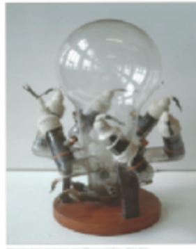
Figure 2: A bulb: piece of industrial history or piece of contemporary art?

<17> The relationships between archival pieces can also be indirect and less obvious, thus enhancing the impact of digital tools as seen in another example drawn from a different area of knowledge; the bulb in the attached photo, if flatly reproduced in a book, could be seen as a piece of contemporary art. [12] Yet it is a piece of industrial history which even a lengthy written explanation cannot properly reassess.