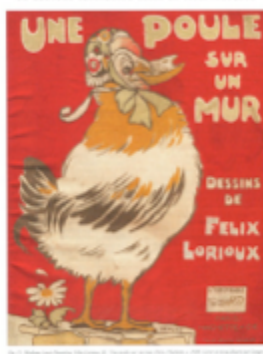
Figure 1: 1920 children's book illustration

[14] As stated by D.Poulot in,[7] cultural heritage is linked to the representation of values forged by societies, to the ways in which they conceive transmission. In France, the importance of literary value explains why the evolution and construction history of the cultural heritage coincides with the history of texts. Similarly in art history, books set the hierarchies, and the choice of paintings and sculptures in museum collections follows the pattern of indications and quotations by ancient historians in their writings. "Reality has come to comply with writings." [8] It is only since the end of the 80ies [9] in France that the notion of cultural heritage has been reconsidered to include a multiplicity of collections both inert and living, objects of all kinds and all periods of times; the extension of the notion of archives to new media collections requesting new archival methods dates back to the 90ies, as shown by the recent interest for audio-visual archives and their still partial legitimacy.[10]