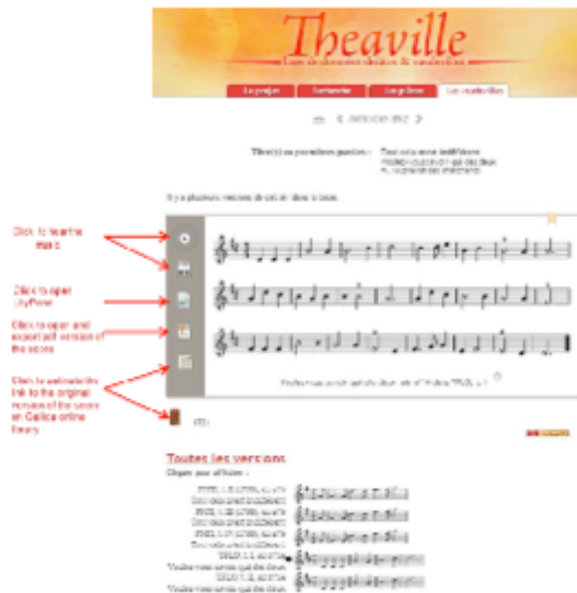
Figure 3: Theaville: a literary and musical research website

<20> Breaking with [biblio-normative] patterns of the past, Web technologies thus provide a flexible, unassuming and user friendly framework of cultural education and information environment at large; they sustain the fluid display of archives or cultural collections at large, which in turn enhances (more or less at will) arrangements by the reader-user; an opportunity and customization of user experience seen as a chain of consequences of user-led, Web 2.0 content creation [14].