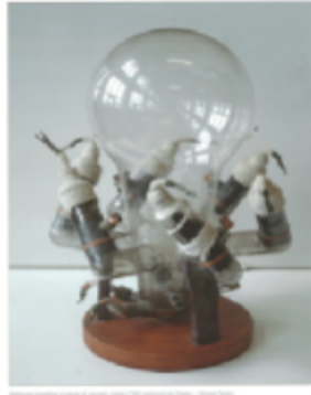
Figure 2: A bulb: piece of industrial history or piece of contemporary art?

<17> The relationships between archival pieces can also be indirect and less obvious, thus enhancing the impact of digital tools as seen in another example drawn from a different area of knowledge; the bulb in the attached photo, if flatly reproduced in a book, could be seen as a piece of contemporary art. [12] Yet it is a piece of industrial history which even a lengthy written explanation cannot properly reassess.