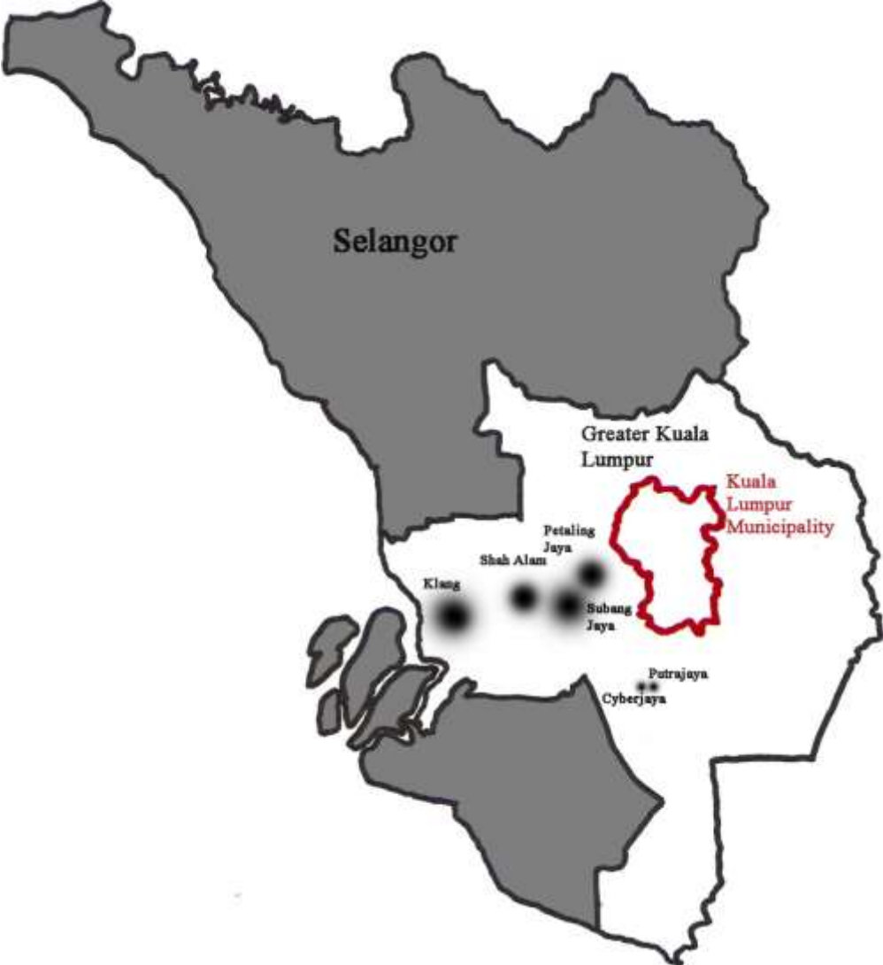
Fig.1: Selangor state, Greater Kuala Lumpur Region and Kuala Lumpur Municipality

worth noting that none of the mega projects that have dramatically changed Kuala Lumpur's urbanscape and international image since the early 1990s could have been undertaken without a massive input of foreign labor. The construction of Kuala Lumpur International Airport (KLIA), for example, is said to have mobilized no fewer than 10,000 foreign workers (Wawa 2005, 177); tellingly as well, the construction of the new Istana Negara – national palace – located on Jalan Duta and home to the ruling king of Malaysia 11 is known to have mobilized at least a thousand irregular foreign workers, employed through contractor and subcontractor chains (The Malaysian Insider online, June 29 2010).