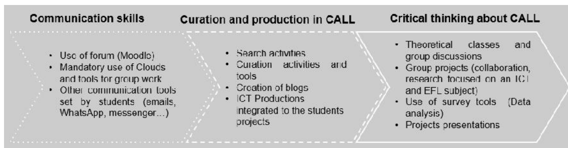
Figure 2. Competencies and activities developed through the course

This experience showed that with our public, some milestones have to be reached to create a positive basis for ICT use in learning and hopefully in future teaching. First, using basic softwares for studying seems uninteresting for the students who master it, but necessary for the few others. Having some compulsory steps in the tasks, and more open possibilities of doing them, has been our choice to deal with their heterogeneity regarding their previous skills. Then we focused on empowering students to use their abilities to engage in learning with technology and to develop new skills or learn to use new tools according to their needs. We tried to develop critical thinking regarding ICT in language learning and teaching (Figure 2).