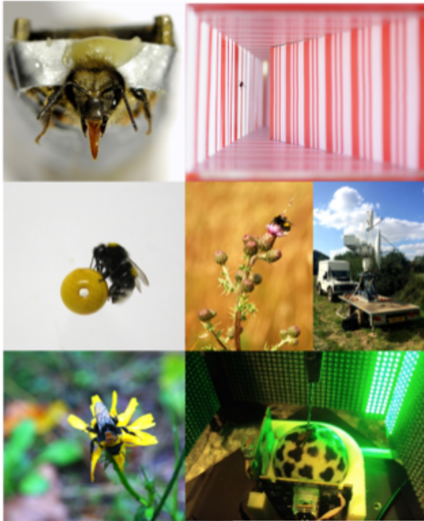
Figure I. Methods for Studying Bee Learning and Memory. (A) Restrained honey bee showing proboscis extension reflex (PER). (B) Free-flying honey bee in a flight tunnel covered with visual patterns generating optic flow [95]. (C) Bumblebee foraging on an artificial flower. (D) (Left) Bumblebee with a radar transponder in the field; (Right) harmonic radar. (E) Bumblebee with an RFID tag in the field. (F) Tethered honey bee walking on a locomotion compensator in a controlled visual environment displayed onto LED panels [97].