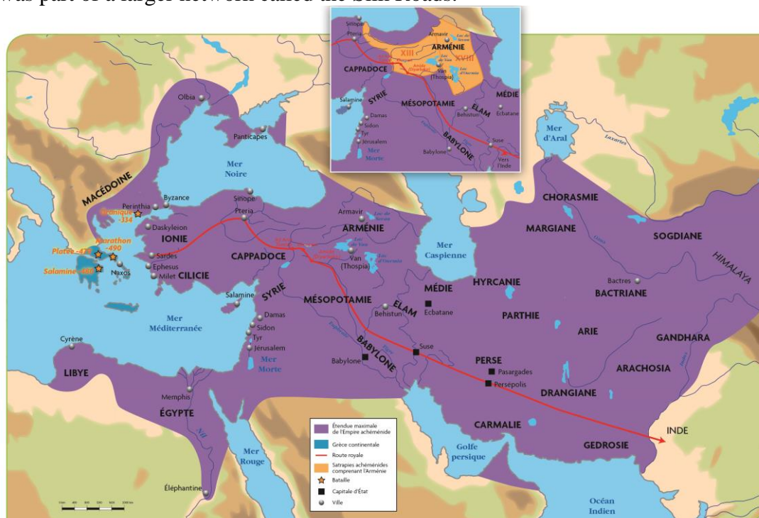
Fig. 1: the Achaemenid empire, under the reign Darius I (521-486 BC) 4

The historical relationships between Armenia and the Indian sub-continent go back a long way, dating back to the Achaemenid period at the latest. In fact, the King of kings, Darius I (521-486 BC) reorganized and developed what was called the Royal Road. This road was built and maintained in order to serve as a link between the main cities of the empire and facilitate a free circulation of people and goods. It went from Susa to Sardis and covered 1677 miles 2 . It crossed the Euphrates River at the level of Southern Armenia, and three stations had been established in that country: Ad Aros Tomisa, Kharpet and Amida (fig. 1). In the first century AD, the Greek geographer Strabo indicated that the road went on from Sardis all the way to India 3 , thus being an important communication channel between both countries, which was part of a larger network called the Silk Roads.