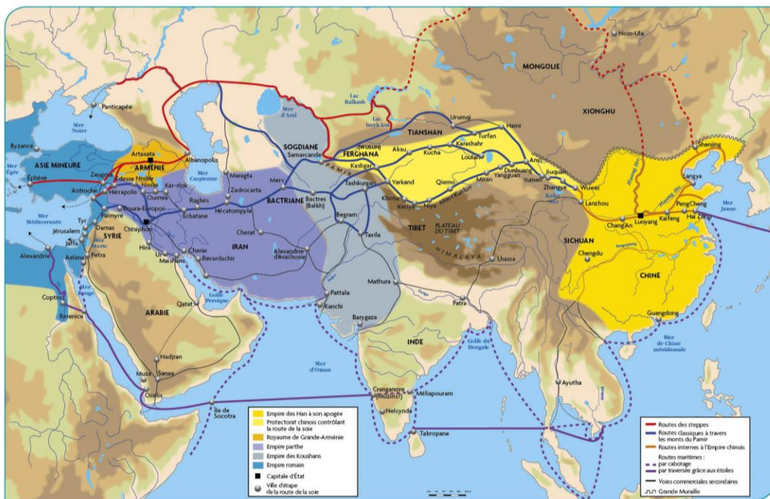
Fig. 2: The Silk Roads in the middle of the first century 6

At this point, a reminder may be opportune: the term ‘‘Silk Road’’ was in fact a triple network of distinct trade routes (Cf. map). The main roads started from Chang’an (Xi’an), built in the Han’s period (206 BC) up to the end of the Tang period (904 AD, with some interruption periods) 5 . On the Han Chinese territory (206 BC to 220 AD), there was a relay station every nine or twelve miles on all the land routes. On that Silk Road, we can mention the Chinese cities of Dun-Huang, Zhang-Xie or Wu-wei. For a general survey, on this question, see my paper one it.