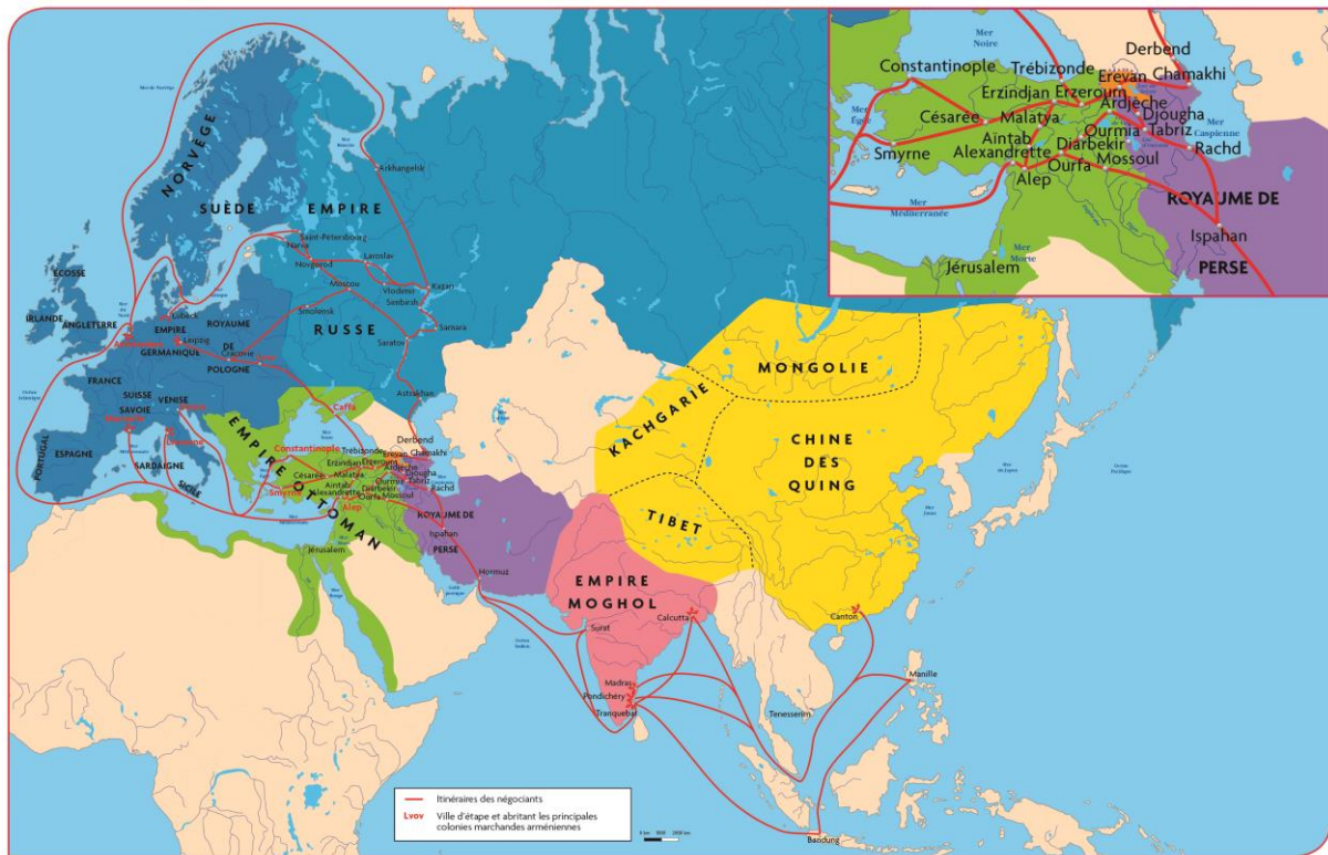
International Network of Armenian Merchants of Nor Djoulfa, circa 1700 25