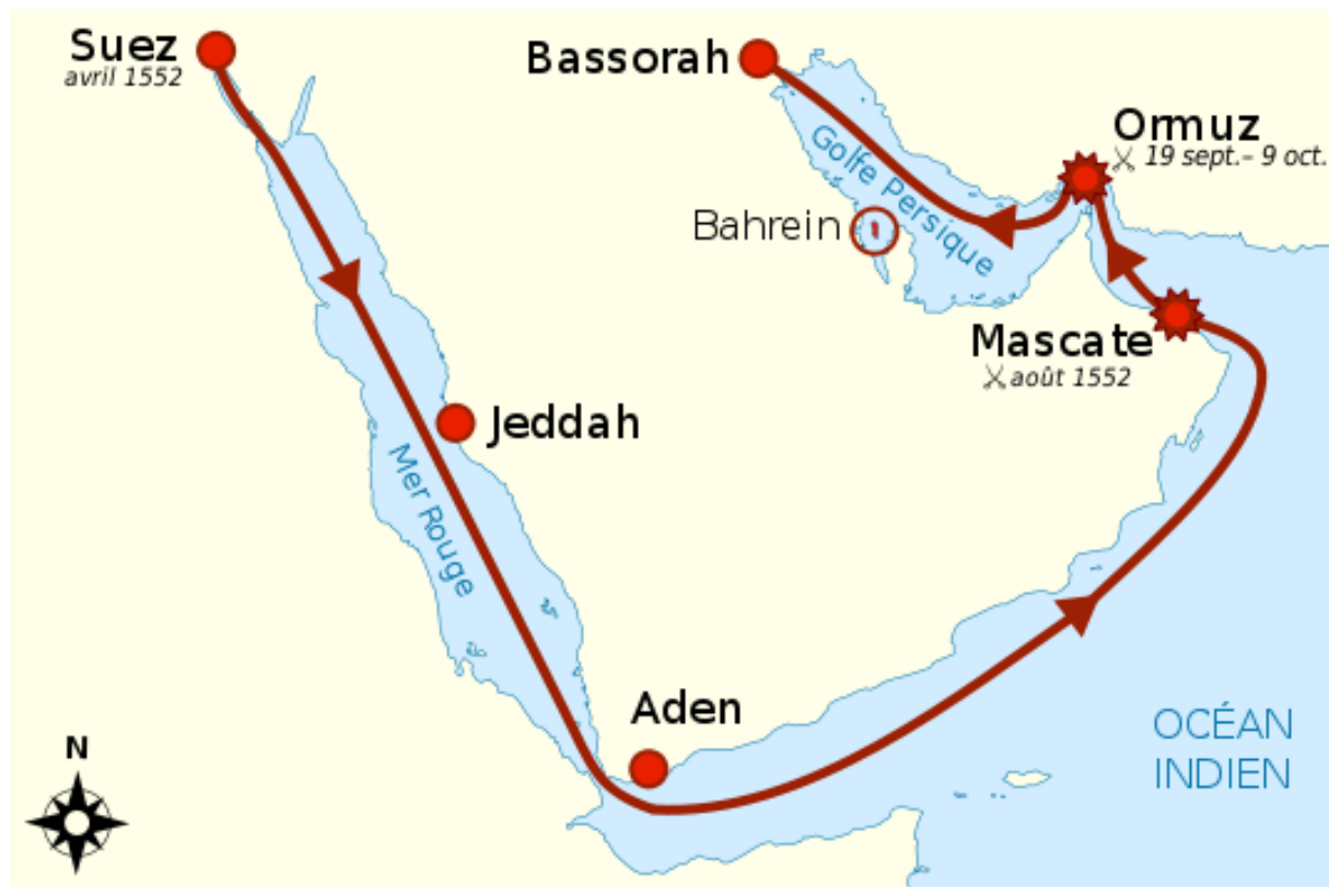
Fig. 4: Piri Reis' campaign against the Portuguese fortress of Hormuz 8

The Portuguese presence in Ormuz resisted the Ottoman Empire's attempted conquest, led from the Port of Suez by "the admiral of the Egyptian fleet", Piri Reis (1465-1554), in September 1552. After a siege lasting one month, the latter had to leave due to a lack of powder and ammunition 7 .