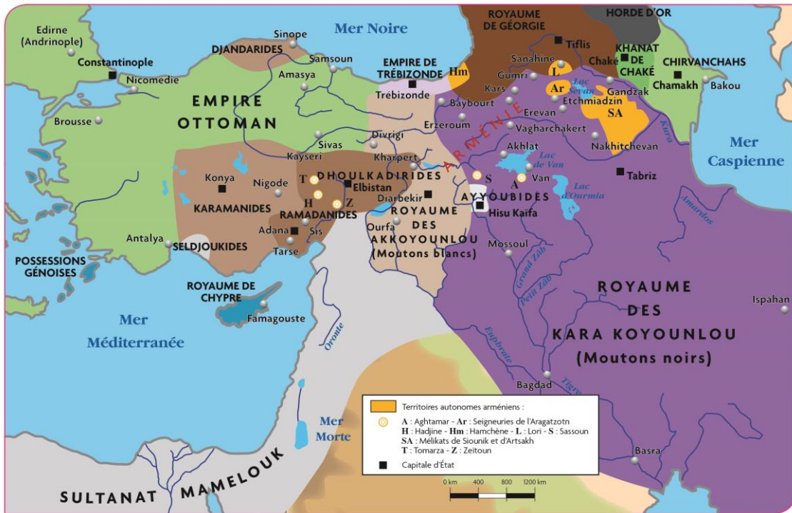
Fig. 1: the Middle East at the fall of Constantinople in 1453 4

This situation of permanent conflict between the collapse of the Mongol Empire, at the end of the 13 th century, and the stabilization of the frontier was a period of desolation and high pressure, particularly for Christians. The situation for Christians after 1639 was far from being one of peace, quite the opposite. In practice, the sovereigns of the Safavid and Ottoman Empires made their shared border almost impenetrable, producing the terrible conditions for the Christians that we are going to consider.