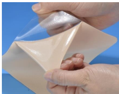
Fig.1 Medical grade adhesive silicone gel for keloids scars

According to their degree of cross-linking, silicone polymers can be elastomers, gels or oils. Due to their versatility, they have a wide range of applications. They are used in building, adhesives and medical industry. In the medical field, polydimethylsiloxane (PDMS) are often used as solid elastomer or gels. For some applications, such as self-adhesive gel sheet (Fig.1) that helps improve the appearance of hypertrophic and keloid scars, both forms must be assembled and used together. In our study we consider a PDMS solid elastomer and two silicon gels, all used in the biomedical field. The aim of this study is to understand and characterize the adhesion between the elastomer and the gels. The ultimate objective is to determine a criterion that can predict a delamination at the interface between the gel and the membrane.