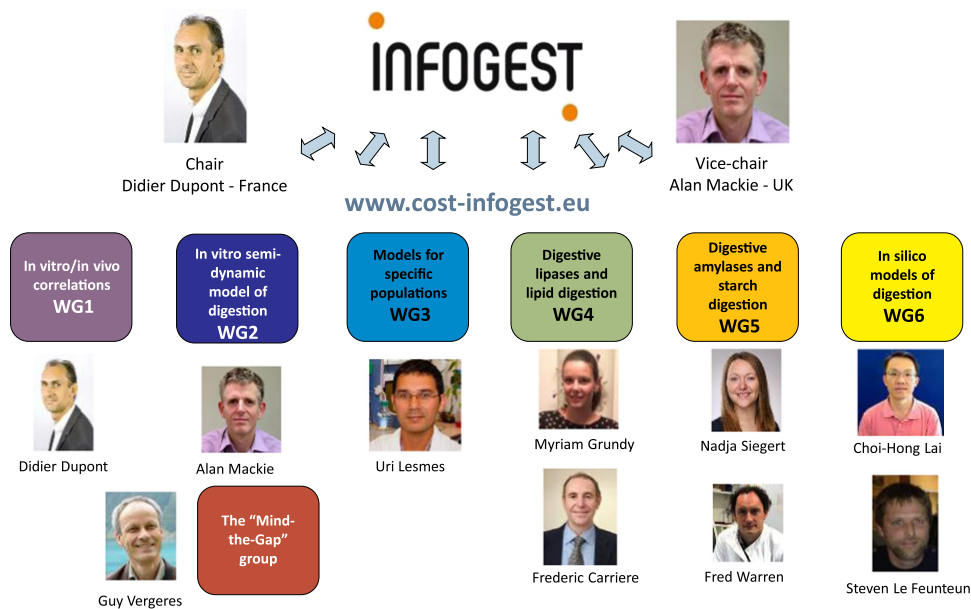
Fig. 2. The INFOGEST Working Groups.