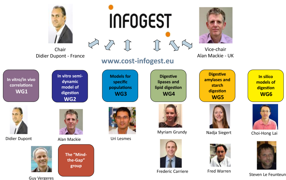
Fig. 2. The INFOGEST Working Groups.