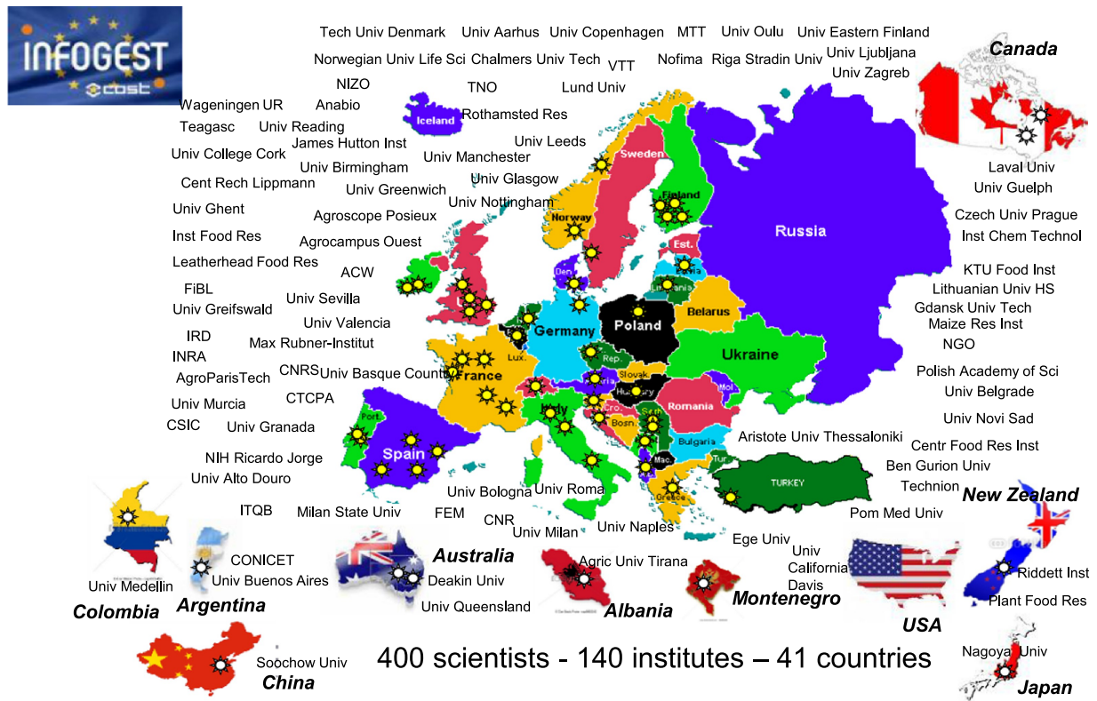
Fig. 1. The INFOGEST international network.