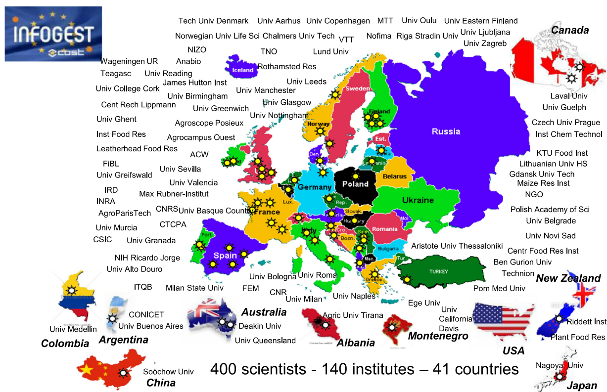
Fig. 1. The INFOGEST international network.