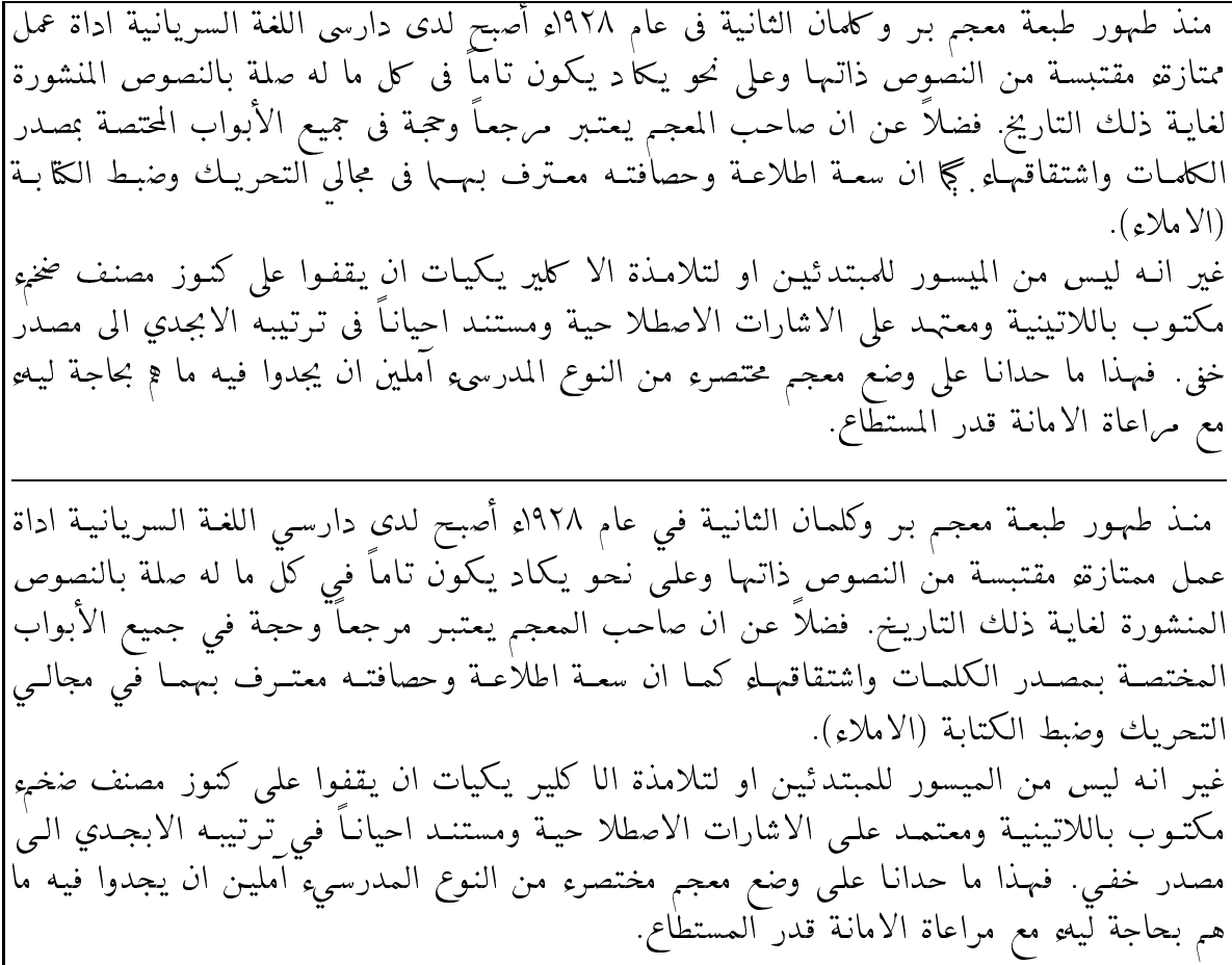
Figure 3: Samples of text typeset with Al-Amal, with (top) and without (bottom) Cairo typecase ligatures