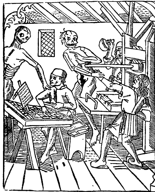
Figure 1: Allegory: input (on the left) and output (on the right) encodings, too close together.

It means that if you are typesetting in some non-American English language covered by current Ba-