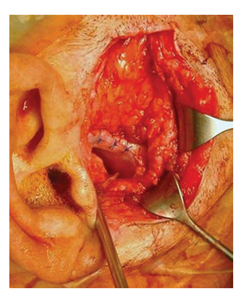
Fig. 1. The silicone sheet in position at the end of surgery and secured by three trans-osseous silk sutures to the zygomatic arch (right side).

Overall, the following parameters were recorded: aetiological context, the model of the silicon sheet (depending on its thickness), the initial postoperative evolution plus any eventual complications, length of the follow-up in months, MO (corresponding to inter-incisal distance in mm) preoperatively and at the final follow-up, and pain score (PS), scaled from 0 to 3 (no pain, light pain, severe pain, very severe pain) preoperatively and at the last follow-up.