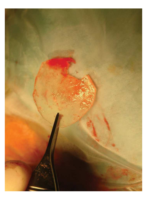
Fig. 4. Example of a deteriorated silicone sheet removed from a patient that had undergone previous surgery in another structure without fixation of the sheet. There is a perforation at its inner part.

was degenerative disease. However, they mention some disadvantages to the TMJ prosthesis: the intervention is longer and more aggressive with increased risks including morbidity, excessive bleeding leading to blood transfusion, infection, and definitive facial palsy. Even though it is rarely mentioned, the ability for mandibular protraction is lost. The real cost of the procedure is not fully known, but it is obviously much greater than for a conservative technique. Furthermore, it is not supported by the Health Insurance Service System in some countries, particularly in France where the TMJ prosthesis is reserved for cases of ankylosis.