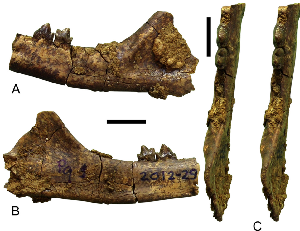
Fig. 2. Propterodon paganensis nov. sp. (Pg1-2011-29). Fragment of dentary with p4–m1. A. Lingual view. B. Buccal view. C. Occlusal view (stereo). Scale bar = 10 mm.