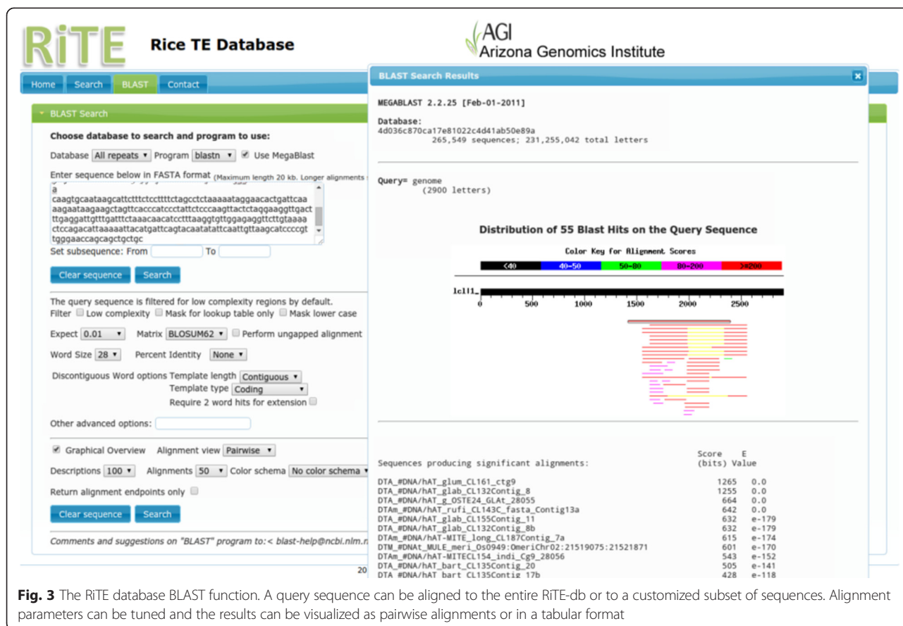
Fig. 3 The RiTE database BLAST function. A query sequence can be aligned to the entire RiTE-db or to a customized subset of sequences. Alignment parameters can be tuned and the results can be visualized as pairwise alignments or in a tabular format

does not reduce all repeats to a consensus sequence and it spans the breadth of a whole genus. The specificity of the three letter-based classification system adopted [14] allows the user to recognize precisely and associate immediately any transposable element or repeated sequence to a corresponding superfamily. In this study, we expanded the Wicker et al. system to incorporate a new set of codes for non-TE repeats and non-autonomous DNATs. This allowed for the incorporation of new types of repeats into the database and to encode information about element transposition capacity.