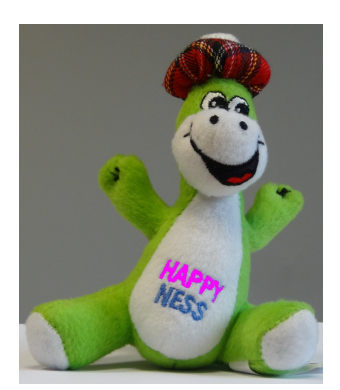
(a) f_0, H_{f_0^c}^{\underline{A}}(R_0) = 198.5

opacity or thickness which are modelled by a LIPmultiplication \triangle by a scalar (Jourlin, 2016).