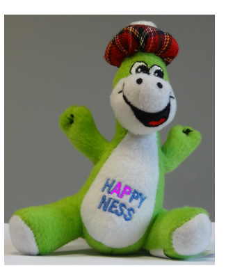
(b) f_0 , Passat et al. (2011)