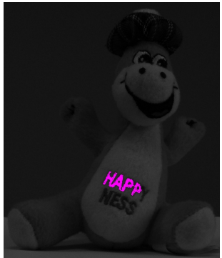
(d) f<sub>1</sub>, Passat et al. (2011)