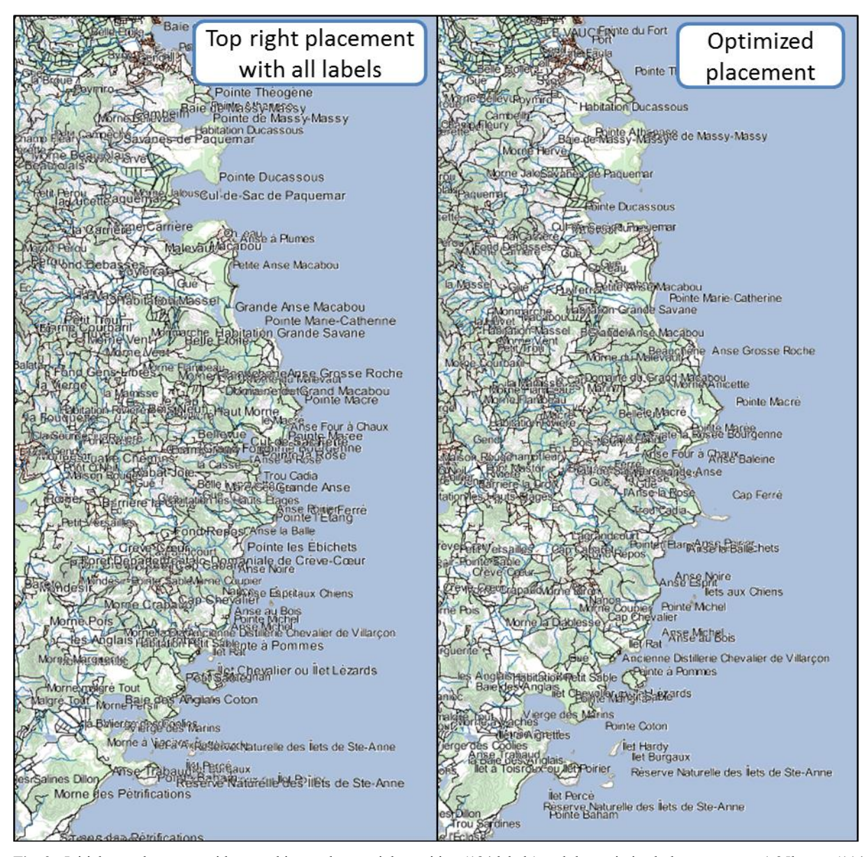
Fig. 2. Initial text placement with everything at the top right position (184 labels) and the optimized placement on a 1:25k map (114 labels left @IGN).

Fig. 3 shows a zoomed extract of the same dataset for a large number of iterations (60,000,000). The placement is clearly better with a significant number of labels removed but the result is not optimal. This can partly be explained by the caricatural size of the text, and its unique size: with only the main labels with this large size and smaller sizes to illustrate decreasing importance, there would be fewer conflicts to solve. However, this preliminary results shows that there is much to do to improve the proposed method.