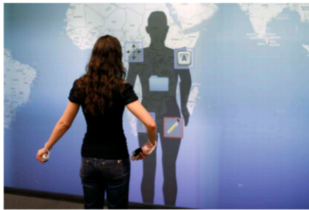
Figure 4: Pointing at body parts for command selection [56]