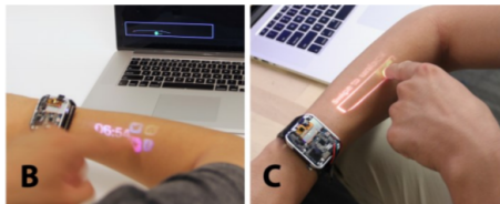
Figure 3: Depth-sensing detection for interacting on the skin using a smartwatch [69]