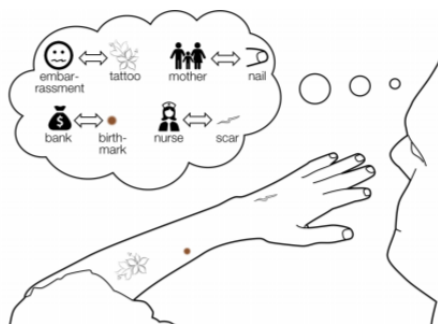
Figure 5: Natural visual landmarks help users memorize [7]