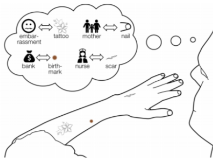
Figure 5: Natural visual landmarks help users memorize [7]

of precision and should be complemented or replaced by other techniques when precision is needed. Mid-air gestures (in 3D) is also a common modality to interact in immersive environments (see [23] for a survey). However, there are no standard gestures set, and mid-air gestures are tiring [30, 34, 46]. Thus mid-air gestures should be designed to reduce fatigue (e.g., relaxed position of the arms), as Liu et al. proposed with Gunslinger [42], and learning should be taken into account.