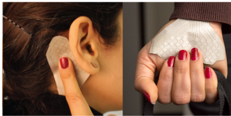
Figure 2: Skin-worn sensing devices [47]

Remote pointing and mid-air gestures. There is a considerable amount of work on pointing (object selection) in immersive environments (see [2, 45] for overviews). The most common technique is ray-casting, the user shows with her hand (or head, eyes, or a device) the area to select. Ray-casting lacks