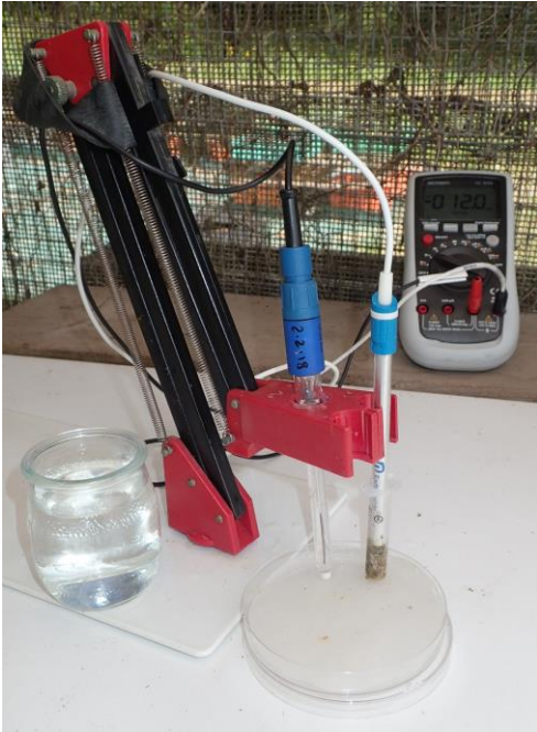
Fig. S2 Measurement of Eh on plant stems. The plant material grinded with a mortar and pestle was placed in the barrel of a 5 ml syringe from which the nozzle had been cut. In the 9 cm Petri dish, the filter paper was moistened with 0.1M KCl solution. The Ag/AgCl reference electrode was placed standing, with tip touching the moist filter paper. The Pt plate electrode was placed in the plant material in the syringe, then the syringe barrel was placed standing with tip touching the moist filter paper.