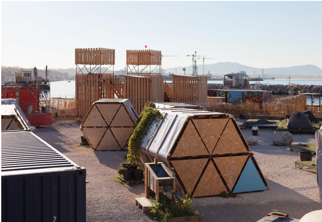
FIGURE 4 'Moissonneuses' - 'Combines' on the front and Perched Huts in the background. Dorms and small rooms built on scaffolds made out of wooden materials and recycled pallets and 'Les Cabanons perchés' (Perched huts) two-storey perched and shady platforms for tents built on scaffolds are among the flagship constructions of the camping. Designed by BC Architect & Studios and Michael Lefeber. (Photograph by Yes We Camp! 2013).