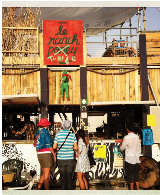
FIGURE 12 Ranch Pony/turtle. Ranch Pony is an example of humour radiating from the constructions, reflecting social practices in place – a two level construction of scaffolds made out of recycled wood for a bar at ground level and a terrace on the floor above, which became the Ranch Turtle by simply putting a mask on the green pony toy hooked above the bar

Hypothesis 6: Material space of particular places possesses a singular and unique surrounding atmosphere, arousing emotional affect in individuals, nurturing a collective sense of place and collective imagination. The initial ambition of the project founders was to create a “multifunctional space, with different equipment and activities that make it attractive for various reasons, by their mutual proximity and by their organization on the site enabling a mix of uses and of public” [1]; “a place of realization of dreams of artists makers and performers” (ibid.) but also “a place where one feels good and where one stays, for a drink or for a long weekend” (ibid.) , a “sort of summer 1936, where perfume of possible is floating in the air” (ibid.).