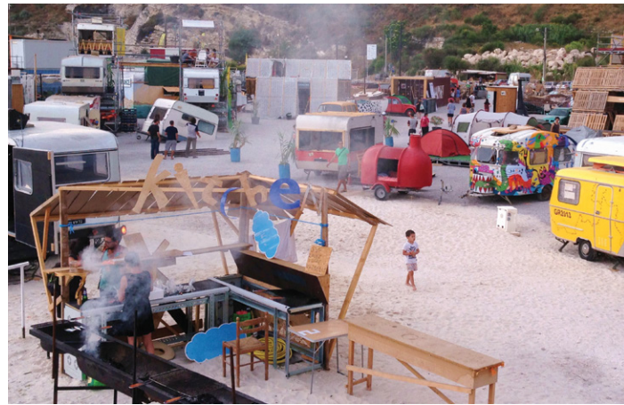
FIGURE 15 The camping's 'permanent' BBQ and some customized caravans. An open kitchen with barbecues was realized with recycled wood. The camp hosted artists in residence who customized recycled caravans.