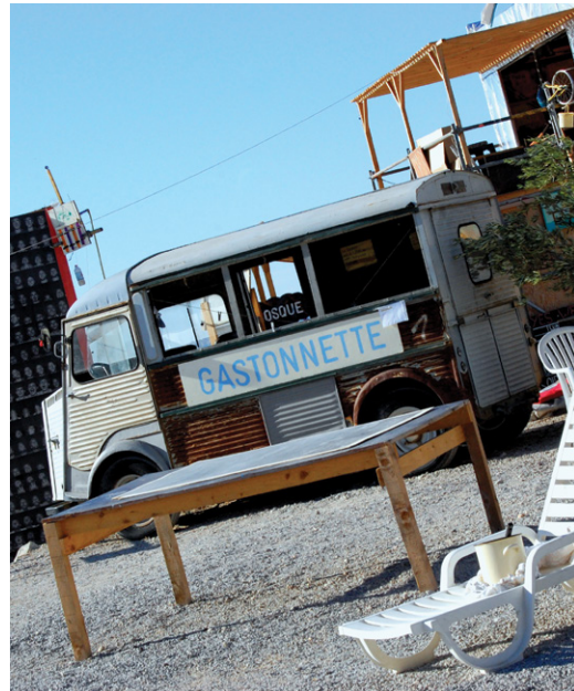
FIGURE 13 Gastonette. “Gastonette” is a recycled caravan that served as an exchange point at the camp illustrates socio-material practices inverting the real world: to purchase food and drinks in the camp the visitors had to convert money into the local currency, Gaston

The atmosphere of YWC was indeed permeated with the sense of ‘another place’ where realization of dreams was possible, and where one could escape the everyday rush and routine and find rest. The campsite radiated a special mood evocative of an island of freedom, humour, joy, and the transgression of established codes that was collectively experienced in bodily presence by the people there. As examples of transgression and humour, one can refer to Ranch Pony/Ranch Turtle (Fig. 12) and ‘Gastonette’ (Fig. 13).