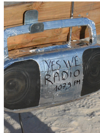
FIGURE 17 A customized radio. In line with the recycling philosophy of the camp, old radio sets were restored and placed in the Yes We Radio space for the camp's radio broadcasts (Photograph by Yes We Camp! 2013).

The realizations reinforced the material expression of the site, in both symbolic and emotional ways, meaning it conveyed and strengthened the emotional resonance of visitors with the camping atmosphere. The mutually reinforcing, dynamic relationship between spatial, material, social and atmospheric dimensions of the campsite fed the understanding of the young volunteering professionals about the way public spaces can be shaped: "I think projects as YWC bring a lot of different elements, that it is people who come by