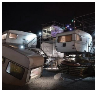
FIGURE 7 'Hameau de caravanes' - 'Hamlet of caravans'. The very first mini-housing facilities built on the campsite were 'Hameau de caravanes' (hamlet of caravans) - recycled caravans perched on scaffolds over two levels.