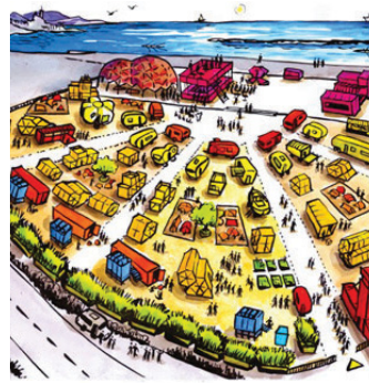
FIGURE 2 The campsite’s overall spatial organization scheme (Drawing by Audebert, A., 2013).