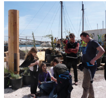
FIGURE 9 Hive Bee Pass. The hive Bee-Pass equipped with a smokestack 2.5 meters high allows bees to live in proximity to humans.

To further question the dominant model of cultural policy and that of cultural production in Marseille [1], the campsite adopted the 'open creativity' approach in campsite construction, through analogy with open source digital platforms, like Wikipedia or GitHub. Participation of various actors, such as artists, enterprises, neighbours and volunteers, was solicited for the implementation of the project. Some creative solutions and constructions that existed as independent constructions and artworks were borrowed to complement the architectural constructions conceived specifically for the camping project: la 'Maison bulle' - 'Bubble house' (Fig. 8), a hive Bee-Pass (Fig. 9), 'Valcoucou SDF-hotel' - 'Valcoucou, a hotel for homelessness' (Fig. 10). The campsite also hosted artists in residence who built original constructions -customized caravans (Fig. 15) and grew a garden (Fig. 11).