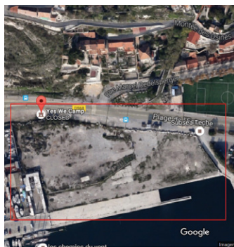
FIGURE 1 The campsite location.