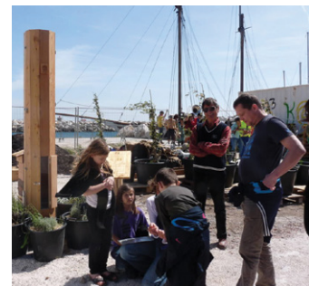
FIGURE 9 Hive Bee Pass. The hive Bee-Pass equipped with a smokestack 2.5 meters high allows bees to live in proximity to humans (Photograph by Yes We Camp! 2013).

To further question the dominant model of cultural policy and that of cultural production in Marseille [1], the campsite adopted the 'open creativity' approach in campsite construction, through analogy with open source digital platforms, like Wikipedia or GitHub. Participation of various actors, such as artists, enterprises, neighbours and volunteers, was solicited for the implementation of the project. Some creative solutions and constructions that existed as independent constructions and artworks were borrowed to complement the architectural constructions conceived specifically for the camping project: la 'Maison bulle' - 'Bubble house' (Fig. 8), a hive Bee-Pass (Fig. 9), 'Valcoucou SDF-hotel' - 'Valcoucou, a hotel for homelessness' (Fig. 10). The campsite also hosted artists in residence who built original constructions -customized caravans (Fig. 15) and grew a garden (Fig. 11).