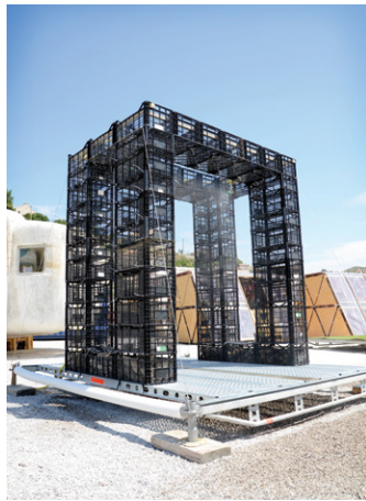
FIGURE 14 Passage au frais. In addition to the main mini-housing and functional constructions, numerous landscape constructions and 'bounty spaces' were created. One is 'Passage au frais' (Passage into the fresh) – a system of water spray constructed out of plastic boxes.

some of the campsite's constructions and furniture, realization of small objects - the campsite's 'goodies', or equipment for specific events, for example, deck chairs made out of recycled pallets (Fig. 16); refurbished old radios for the Yes We Radio space (Fig. 17) and a giant grill.