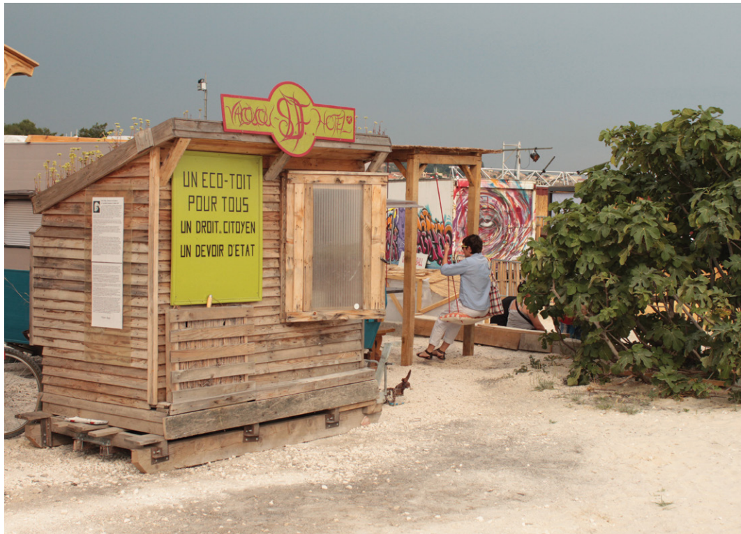
FIGURE 10 Valcoucou SDF Hotel. 'Valcoucou SDF-hotel' (Valcoucou, a hotel for homelessness), an artistic activist project built as a reaction to the policy of N. Sarkozy.