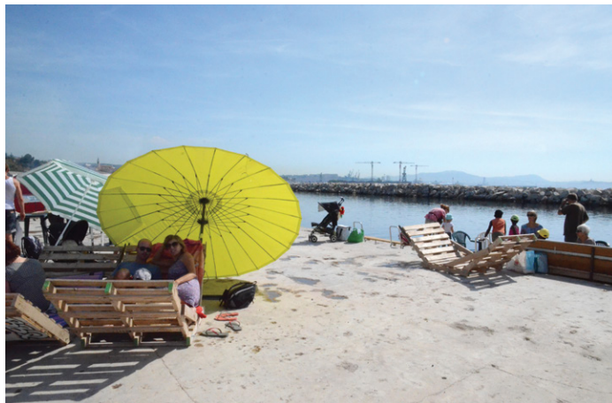
FIGURE 16 Deck chairs. Recycled materials and objects served as raw materials for the realization of some of the camp's constructions and furniture, such as the construction of deck chairs out of recycled pallets.