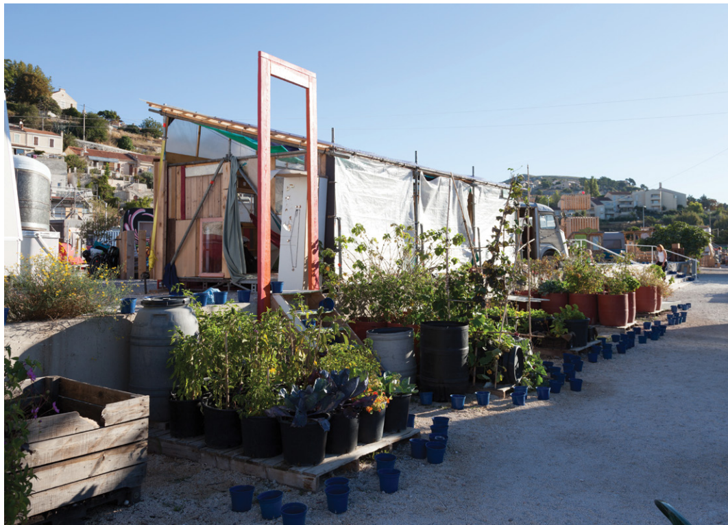
FIGURE 11 The garden. The garden is an experiment with above ground permaculture adapted for urban life that made the campsite green (Photograph by Yes We Camp! 2013).