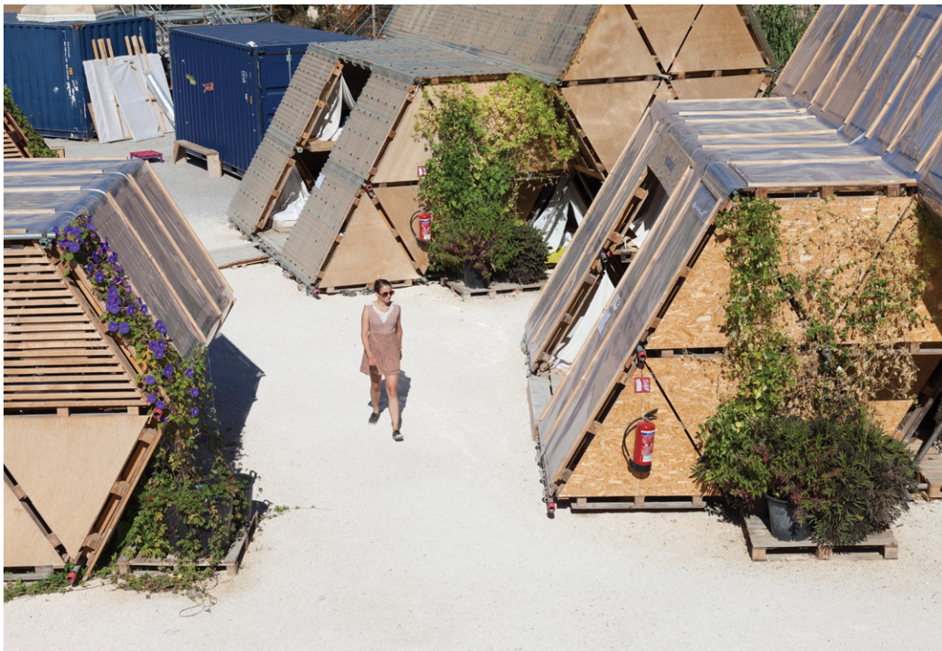
FIGURE 5 'Semeuses' - 'Sowers'. Dorms and small rooms built on scaffolds made out of wooden materials and recycled pallets. Designed by BC Architect & Studios and Michael Lefeber (Photograph by Yes We Camp! 2013).