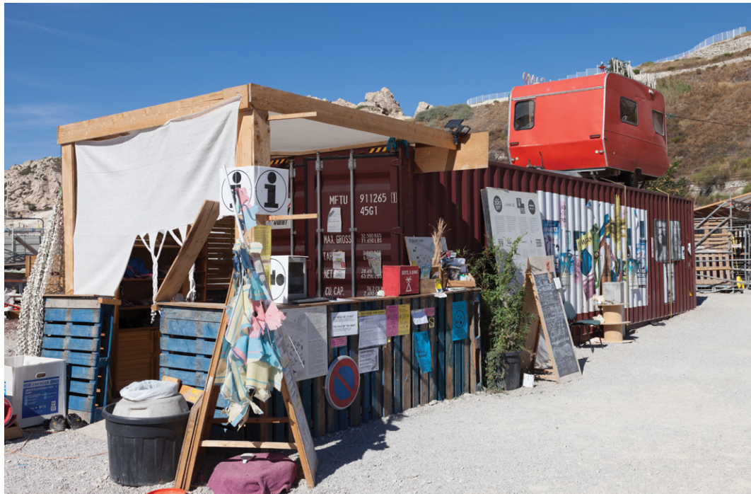
FIGURE 6 The campsite's reception desk. The reception desk of the campsite was built out of a recycled container.