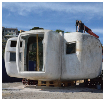
FIGURE 8 Bubble house. Designed in the sixties by architect Jean Benjamin Maneval, the habitat is composed of six plastic shells. It was first used in the campsite Elf Aquitaine and then recovered by a group of artists and performers. An example of architectural utopias of pop art, Bubble house was one of the emblematic habitats of the campsite (Photograph by Yes We Camp! 2013).