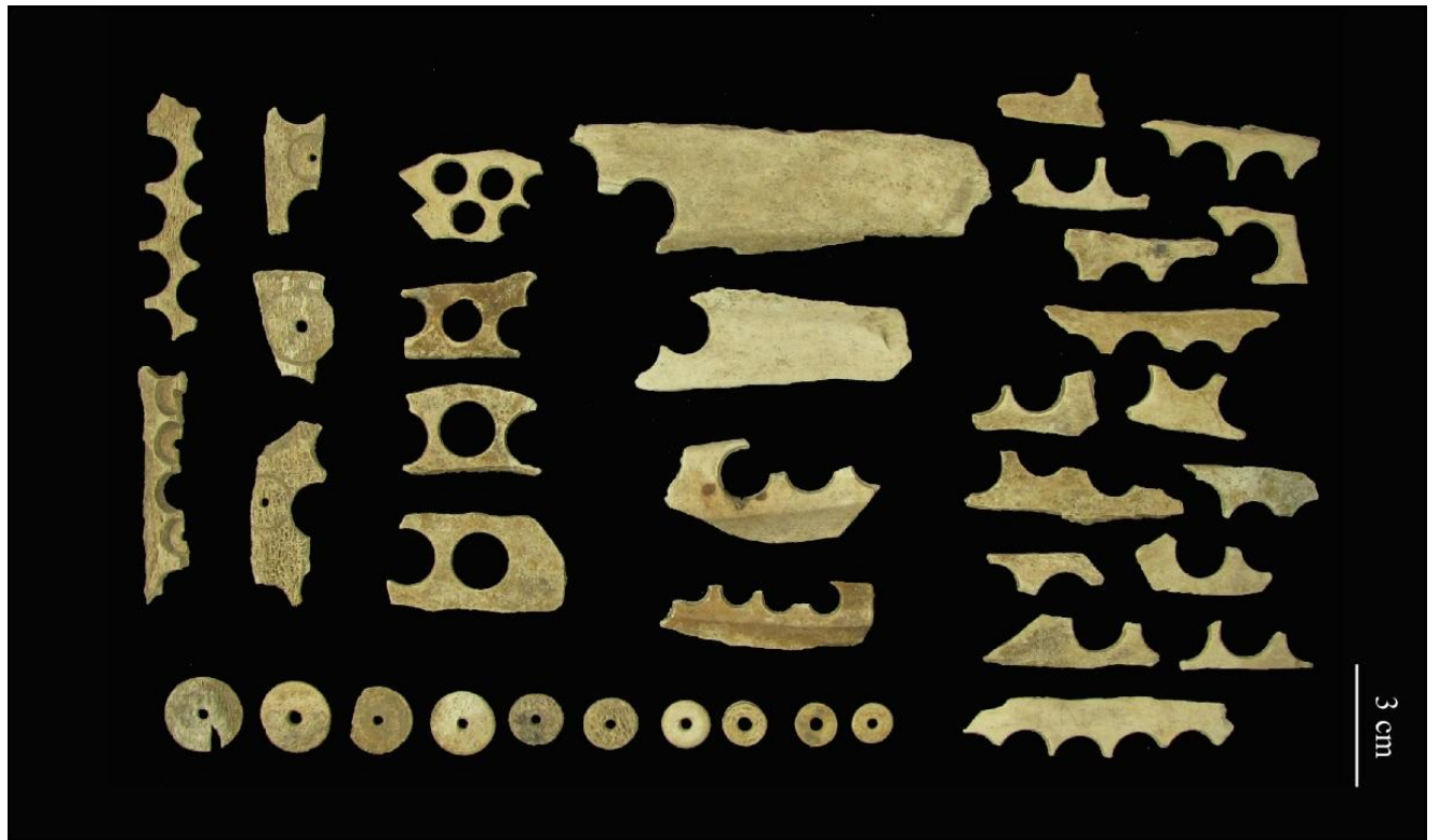
Figure 4: Habitation Perrinelle, waste and worked bones (Surveys S1/S2) .