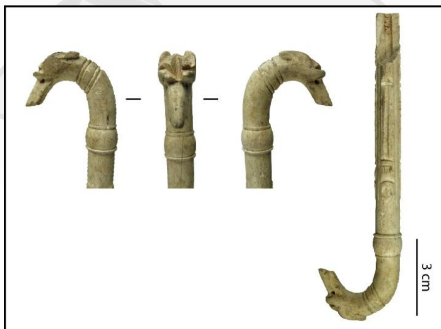
Figure 2: Parasol handle, 1840-1855 (US 532, Allée Pécoul).