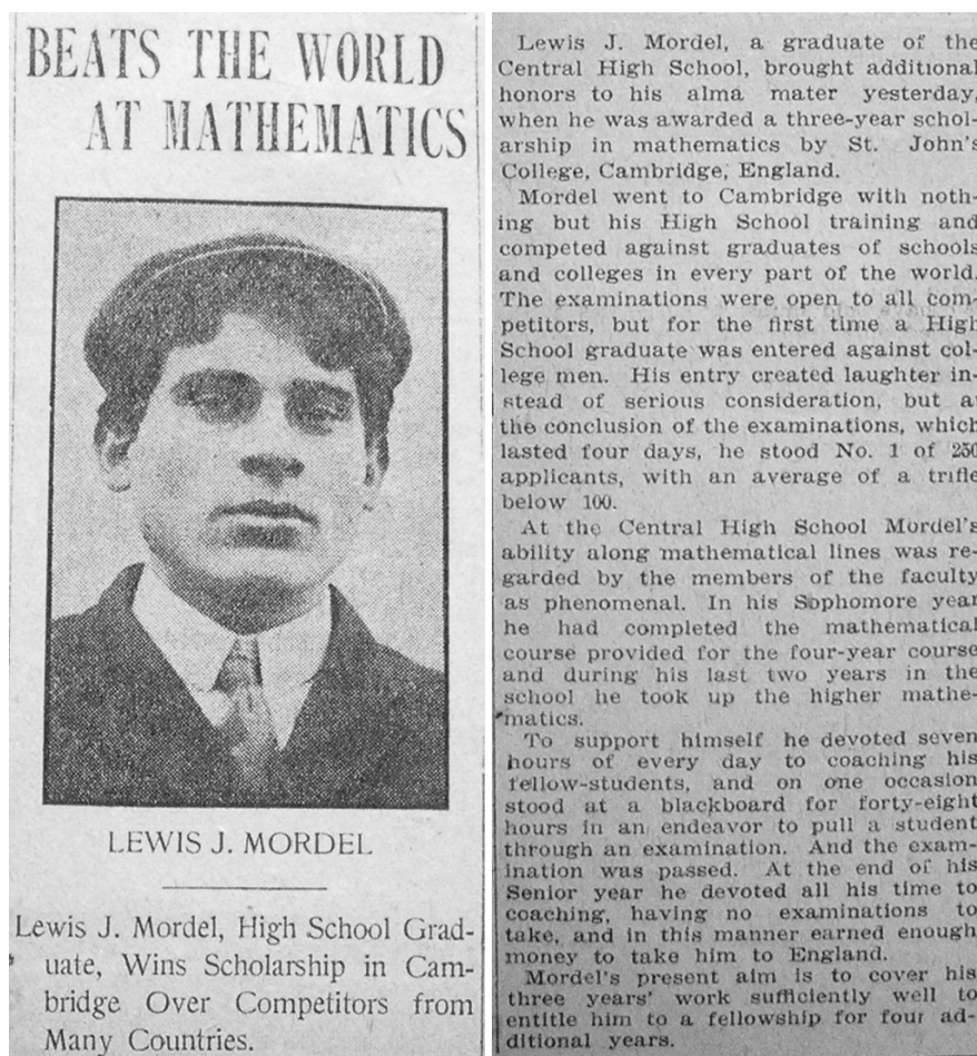
Figure 1 – Press cutting from The Philadelphia Press (January 10, 1907) conserved in St John's College Library, Papers of Louis Joel Mordell (box 4, folder 41).

taken from Cambridge scholarship examinations and from the Mathematical Tripos. 11 This, he explained, triggered his desire to sit the examination to be admitted to one of the colleges of Cambridge, where he could study mathematics. Mordell did so in December 1906 and was ranked first—this success created a little local fame in Philadelphia, as a press cutting from The Philadelphia Press dated January 10, 1907 attests (see figure 1).