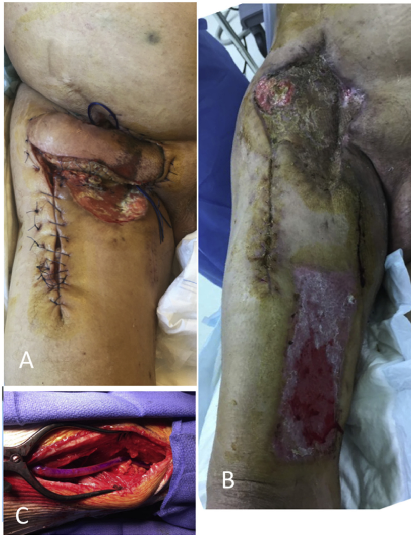
Figure 1. Wound of the groin (A) myocutaneous flap after groin necrosis. (B) Pre-operative status. (C) Distal anastomosis to the popliteal artery by lateral exposure.

From the fenestration the bypass was tunnelled deep to fascia lata. Popliteal artery exposure was via a lateral approach. The distal anastomosis was constructed, using a cold stored venous allograft, to the retro-articular popliteal artery laterally (Fig. 1C). Cefazolin was administered for a further 15 days. The post-operative course was uneventful (Fig. 2), with complete resolution of tissue loss after minor amputation. The patient had significant hip pain requiring one week of morphine. With physiotherapy the patient could walk fully independently after one month. At one year follow up, the bypass remains patent without graft or wound infection.