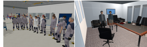
Figure 1: Scenarios: managers (left) and sales representatives (right) the user tests we carried out. We will finish by analyzing results and underlying the directions of our future works.

We propose a VR tool as a solution to identified limitations. Virtual Reality allows living virtual experiences, which can answer to realism and contextualization lack. This paper is organized as follows. On the next section, we will introduce related work. Afterward, we will present the VR prototype we implemented, and then