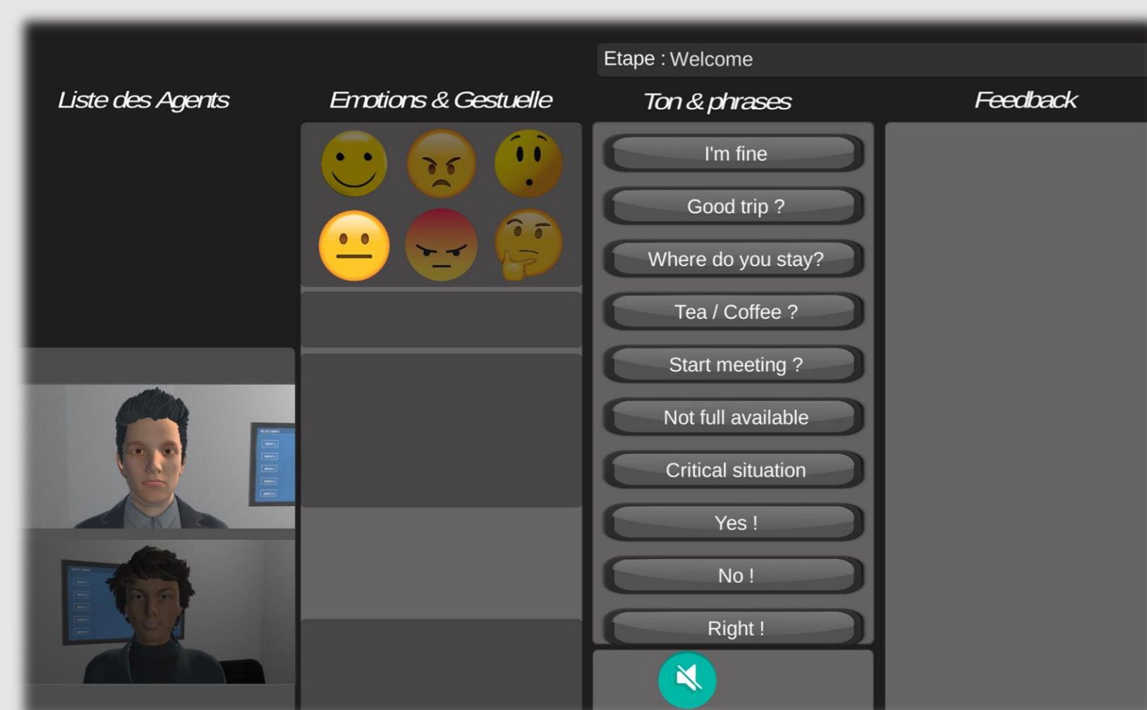
"Wizard of Oz" control panel