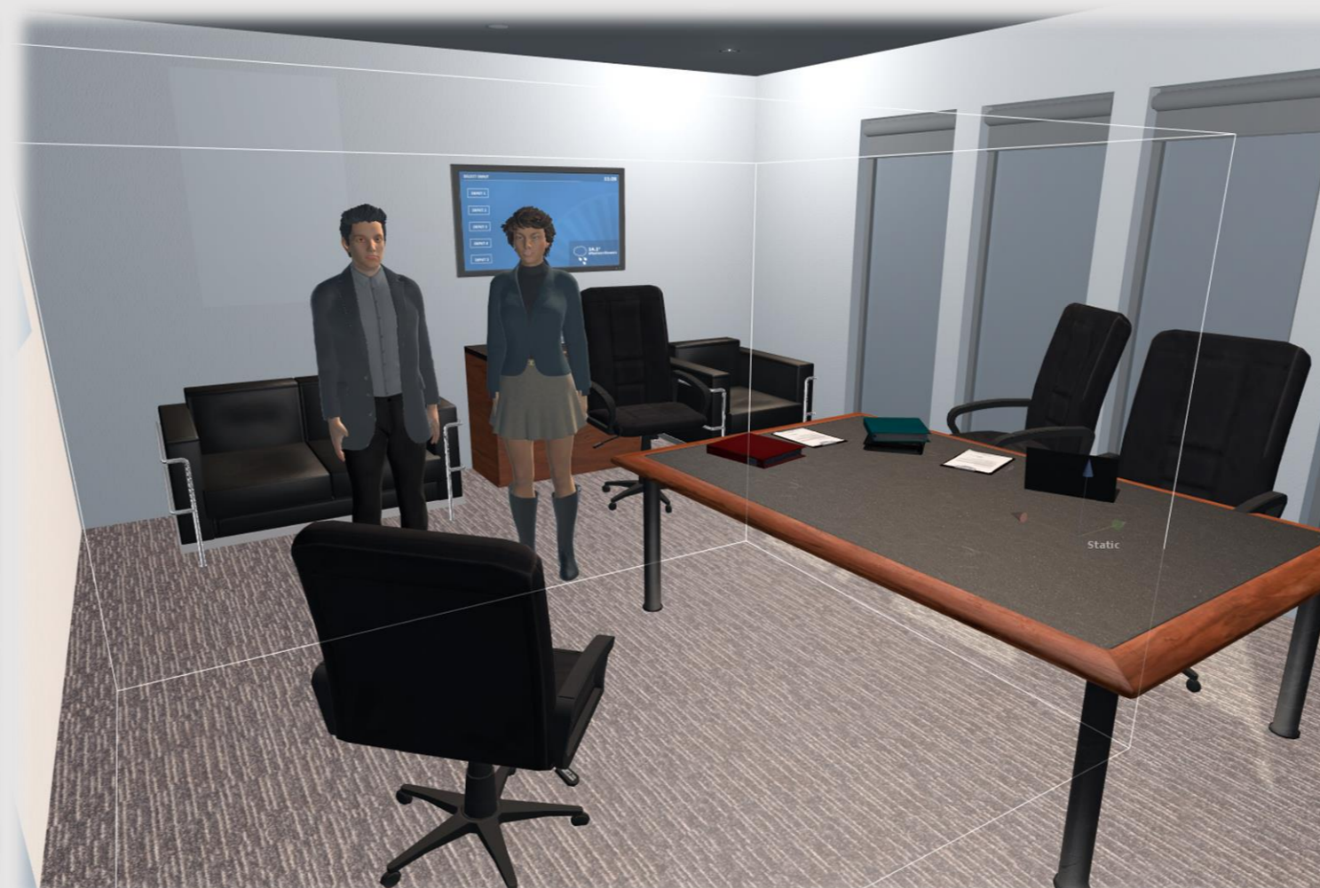
Sales representatives' scene