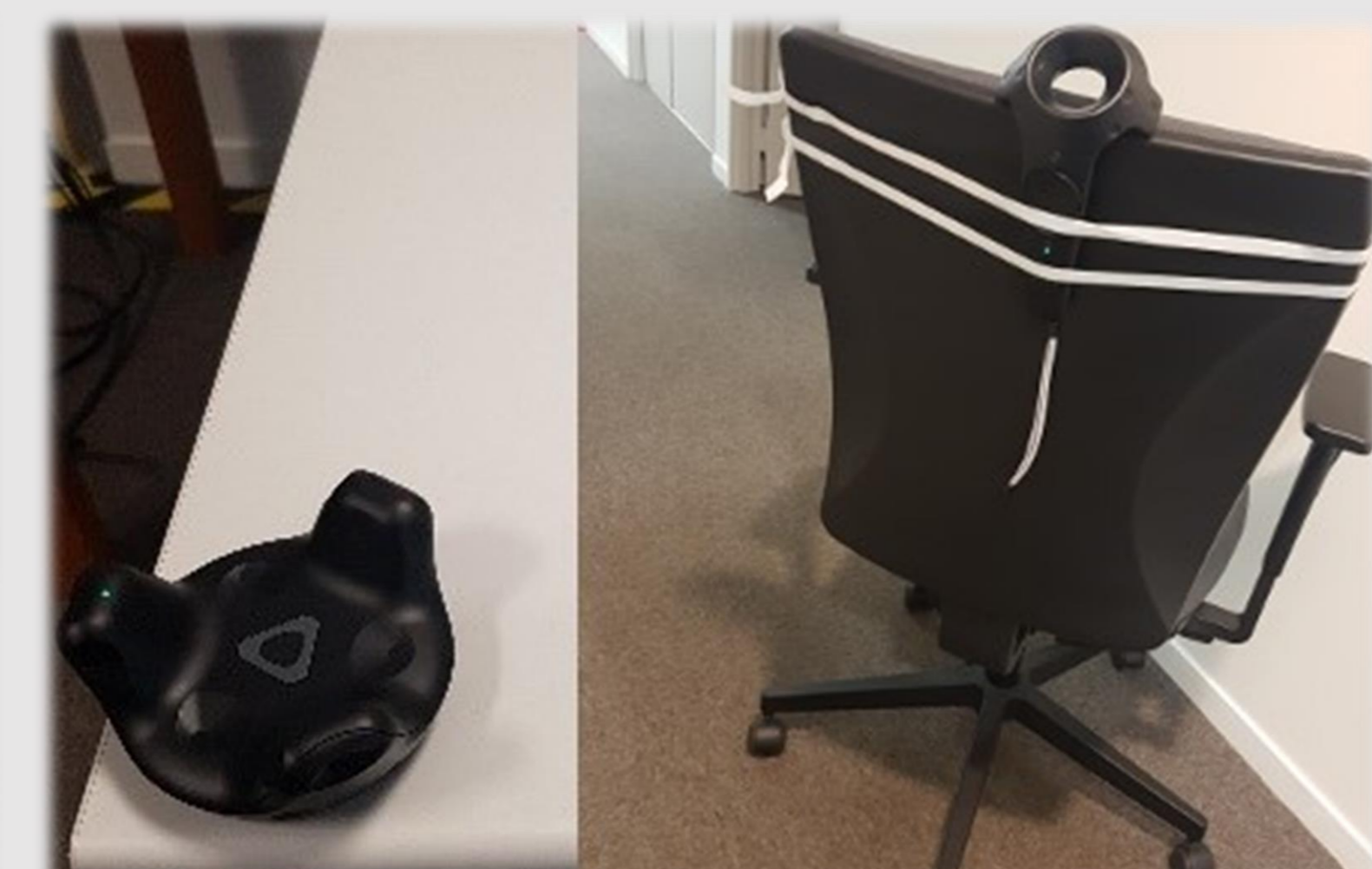
Real objects tracking