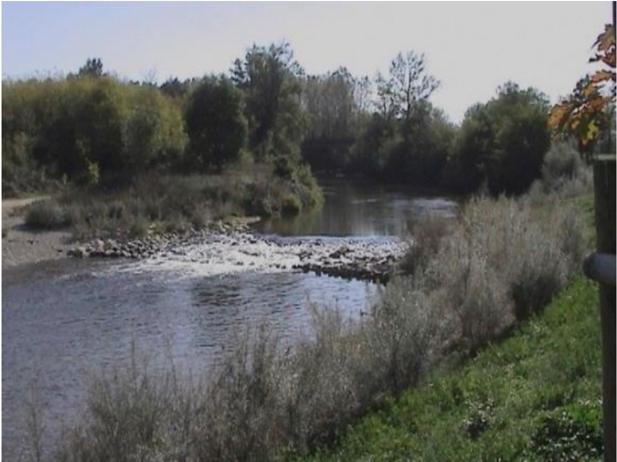
758 Figure 6: Rough rock ramp with integrated fishway, providing positive action for both riverbed 759 stabilization and fish movement