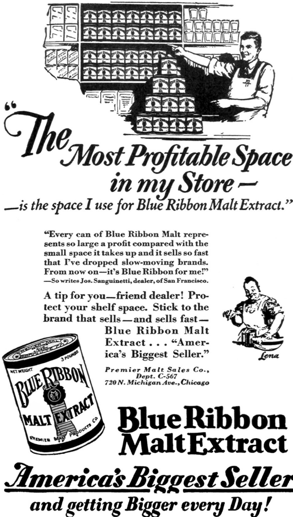
Fig. 7 Blue Ribbon Malt Extract (1929, 08, 51)

In the advertisement in Fig. 8, Libby's takes a step further. The staging is the same, with the double exposure of tin cans on shelves or in a stack and the presence of the grocer. However, the counter, now redundant, has disappeared, leading to new and subtle changes: by moving to the floor, the pile of tins has grown; in jumping to the other side of the counter, the stacked or shelved tins have become fully accessible to customers. Thus, as we gradually discover, tins initiated the self-service era in small and traditional grocery stores in the 1920s rather than in the larger, subsequent supermarkets. Of course, the transition was conservative: the grocer was retained, but his stacking was clearly reversible, able to become a taking gesture and transferable to the client; the purpose was to teach grocers "gently" that tins were not only stackable, as highlighted by the previous advertisements, but that they could also be left to be handled directly by clients without fear of material damage (being solid) or sanitary