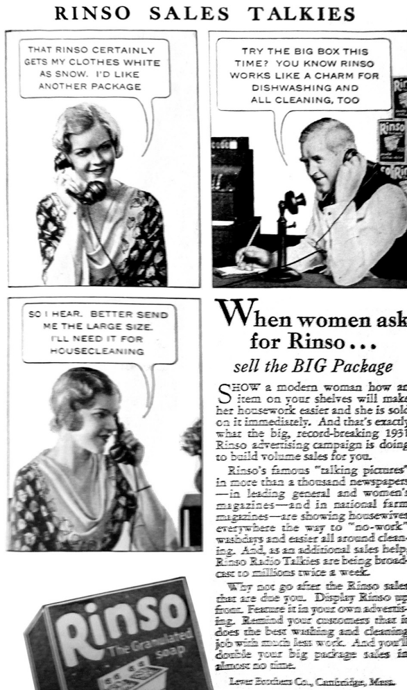
Fig. 3 When women ask for Rinso... (1931, 05, 13)

the problem was even greater with motorised delivery, which involves far higher expenses and investment than telephone service. However, and paradoxically, we learn that in the case of the Weber store, "The time and cost of delivery [was] cut down". Other contributions supported this type of statement with several arguments. One was to observe that the alleged savings from carried away sales were exaggerated. An article claimed that delivery was not an "extravagance" and noted that if the average basket purchased in a cash and carry store amounted to 81 cents, the average amount of an order placed by telephone and delivered to the customer amounted to $1.91. Managing large orders was now less costly: an average of 4 min and 26 s was spent to sell a cash and carry order against 1 min and 57 s for a telephone order. The article also pointed out that the cash and carry system was an economic solution invented by the federal government to alleviate the difficulties of the war, the economic advantages of which had been greatly exaggerated, so that returning to deliveries ought to be defended