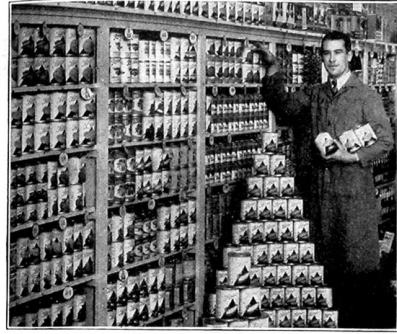
One of the DeVos Stores, Seattle, Washington, featuring the Libby Line

Mr. DeVos’ plan, used successfully by thousands of other grocers, is a simple, practical one for increasing your profit and sales on canned foods. It is known as the Libby Idea. For