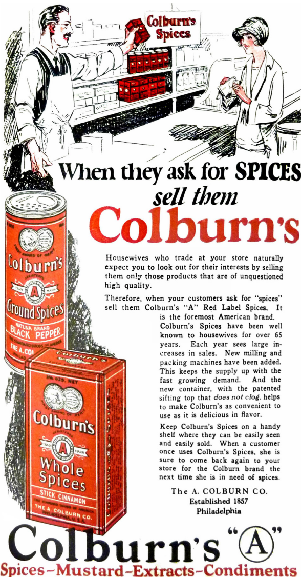
Fig. 5 When they ask for spices sell them Colburn's (1923, 06, 61)

others took court action that led to pure food and competition legislation. These two types of action finally forced the content and origin to be marked and, incidentally, the branded and packaged presentation of products. With bulk sale, only one choice was possible for the same generic product and the only way of assessing it was to taste, look at, touch and smell it. However, this shift was not solely due to the packaging innovation because packaging also had to find its place in a retail environment that had very good reasons to remain attached to bulk foods: with bulk food, the retailer had control of product origin, price and qualification; he could easily substitute one provider with another without the possibility of his customers noticing the substitution