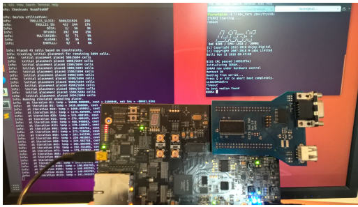
Fig. 3. Versa ECP5 + SDRAM SoC Hat with LiteX / LiteDRAM

This example proves that LiteX entry can be used with a fully open-source toolchain. Lattice iCE40 and ECP5 FPGAs are already supported. Furthermore, these tools have been designed to be portable to others FPGA families. Communities are actually documenting other FPGA families, so we could expect having fully open-source toolchains for Xilinx and Altera FPGAs in the next couple of years.