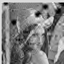
Figure 3 (left): The reconstructed image using selection of random oligos.