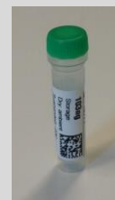
Image 1 (left): The storage tube containing 103 ng of synthetic DNA