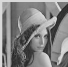
Figure 2 (left): The reconstructed image using the most frequent oligos. (No sequencing noise)