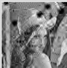
Figure 3 (left): The reconstructed image using random selection of oligos.