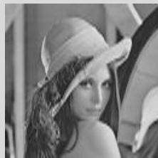
Figure 2 (left): The reconstructed image using the most frequent oligos. (No sequencing noise)