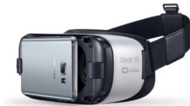
Figure 2. The SamsungGear (Samsung, Seoul, South Korea) consists in a plastic mask in which we insert a smartphone.

We used two identical smartphones in order to quickly switch between the two experimental conditions (with and without PHMD). In both conditions the subject wore a SamsungGear (Samsung, Seoul, South Korea) device ( Figure 2 ). In one condition (without PHMD) the smartphone was switched-off, and in the other (with PHMD) it was switched-on. Anything else in the two conditions was identical. The smartphone used as VR devices was a Samsung S6 running under Android OS Nougat. The Specific Absorption Rate (SAR) of the smartphone was 0.382 Watt/Kg (Head) and 0.499 Watt/Kg (Body).