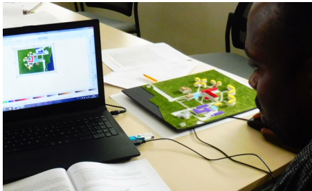
Figure 2: Content creation for teachers: an O&M instructor associates the TTS information with a tactile map. The instructor uses Inkscape (on the screen on the left of the image) to draw the interactive zones on the picture of the real tactile map (visible on the table on the right).