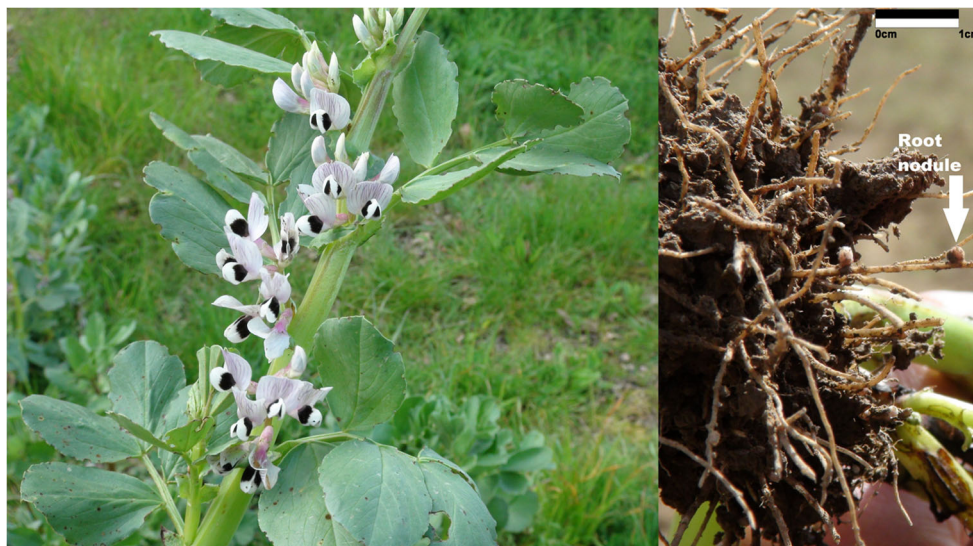
Fig. 1 Protein crops such as faba bean ( Vicia faba L.) are of particular interest for farmers since they can convert nitrogen gas into ammonia within root nodules that contain symbiotic bacteria. This biological nitrogen fixation may allow farmers to reduce the use of nitrogen fertilizers. Despite this benefit (among others), however, production of protein crops in Europe remains low.

In this study, we surveyed a sample of farmers growing protein crops in western France about (i) their motivations for growing them, so that extension programs can be improved based on their perceptions, and (ii) crop management systems they commonly use for them, so that the most promising ones can be developed for farmers. We assumed that exploration and analysis of farmers' perceptions would supplement studies based on historical and statistical data. We also assumed that exploration and analysis of farmers' practices would bring focus on innovative types of crop management that could help overcome the weak development of current production systems.