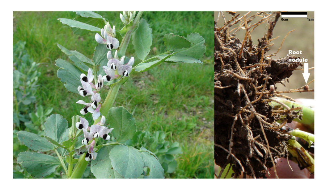
Fig. 1 Protein crops such as faba bean ( Vicia faba L.) are of particular interest for farmers since they can convert nitrogen gas into ammonia within root nodules that contain symbiotic bacteria. This biological nitrogen fixation may allow farmers to reduce the use of nitrogen fertilizers. Despite this benefit (among others), however, production of protein crops in Europe remains low.

In this study, we surveyed a sample of farmers growing protein crops in western France about (i) their motivations for growing them, so that extension programs can be improved based on their perceptions, and (ii) crop management systems they commonly use for them, so that the most promising ones can be developed for farmers. We assumed that exploration and analysis of farmers' perceptions would supplement studies based on historical and statistical data. We also assumed that exploration and analysis of farmers' practices would bring focus on innovative types of crop management that could help overcome the weak development of current production systems.