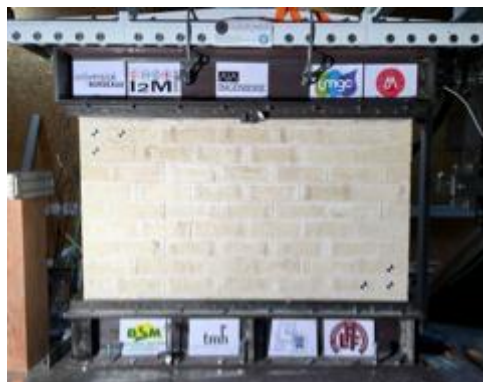
Figure 1: wall subjected to shear load under constant normal load

The context of this work is architectural heritage preservation. The aim of the study is to validate a numerical model [1] which simulate the mechanical behaviour of masonry wall. To achieve this objective, we carried out an experimental assessment and a simulation of the in-plane mechanical behaviour of a masonry wall subjected to in-plane shear load under constant normal load (corresponding to a global normal stress on the horizontal mortar joints of 0.3 MPa). The wall which represents a \frac{1}{2} scale real structure is composed of limestone blocks bounded by thin lime mortar (figure 1).