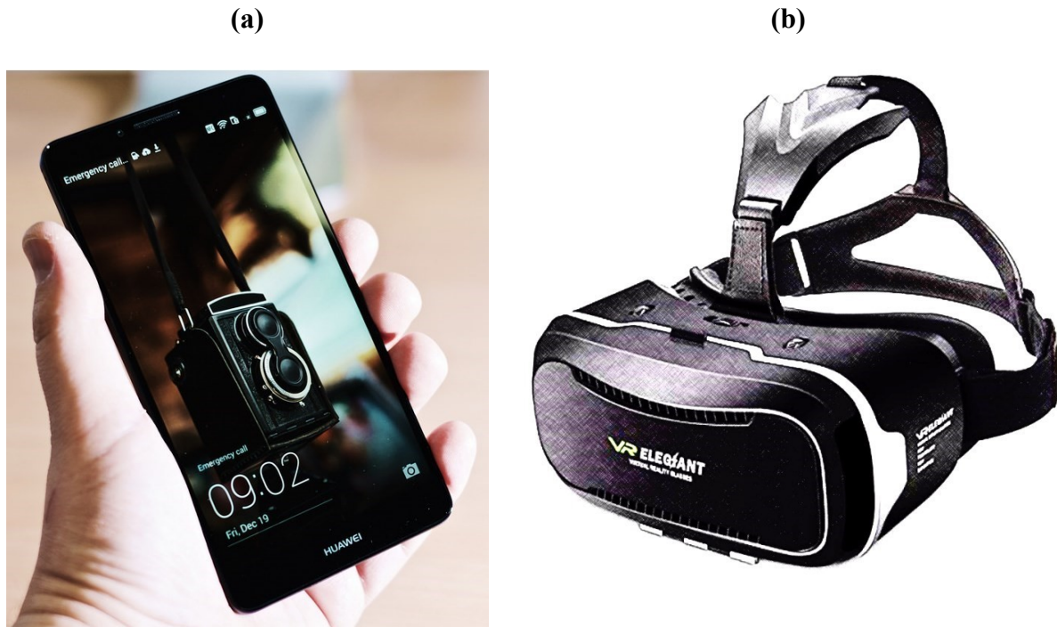
Figure 1. (a) Huawei Mate 7 (Huawei, Shenzhen, China) and (b) VRElegant (Elegant, Austin, the US).