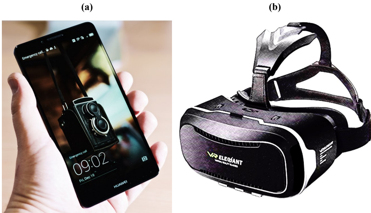
Figure 1. (a) Huawei Mate 7 (Huawei, Shenzhen, China) and (b) VRElegant (Elegant, Austin, US).