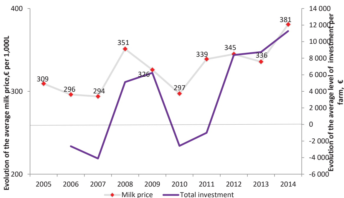
Figure 1: Evolution of the average level of investment and milk price for the sample used between