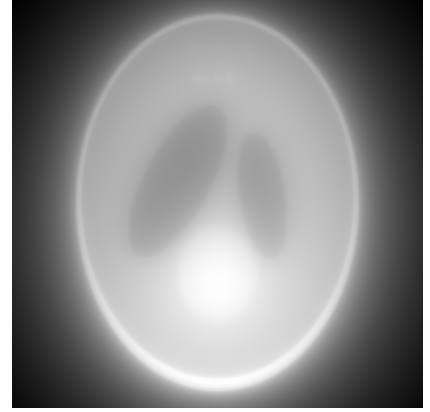
Fig 3 Obtained SF backprojection