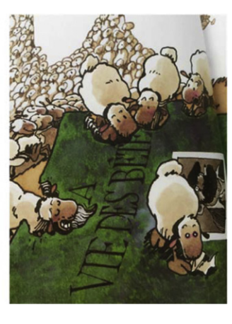
Fig. 2 The milking of woolly aphids, as cited by Boris Vian in Les Fourmis (Gallimard, La Pléiade) and reported on the left, with a possible representation on the right: Le Génie des alpages, F'Murr, Casterman.

(Gallimard 2010 Ouvres romanesques complètes p.$$)