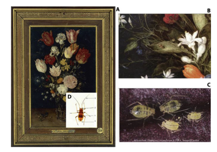
Fig. 1 Bouquet of flowers in a vase, by Jan Brueghel the Elder (1608, oil on copper 65 \times 45 cm); original (A) in the Pinacoteca Ambrosiana (Milan, Italy), © with permission. Detail with an aphid on a lily leaf (B) situated at the bottom-left corner of the bouquet. Inferred species, with the help of Dr C. Favret: Neomyzus circumflexus, quoted from Encyclop'aphid (C) with its typical darkish crescent on the back (D).