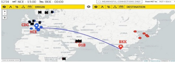
Figure 1: Screen-shot of PlanetOptim application. CDG: Paris, DXB:Dubai, NCE:Nice, BKK:Bangkok, dashed airports represent uninteresting airports.

The FRP is formulated as finding a maximal subgraph such that for each node there exists a path that satisfies the regret constraint. The regret is defined for each criterion. Such paths can be retrieved using shortest paths algorithms. We simply begin by working on the CFN, which is stored in a graph database Neo4j. This database uses a graph structure and its graphical interface visualizes easily the airline network. However, Neo4j stores each node's and arc's properties separately: accessing those properties is relatively slow. Then, implementing the SPA in a graph database like Neo4j is challenging.