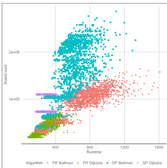
Figure 3: Analysis of the runtimes and scan counts.

It means that the additional time spent to read all properties is not compensated by the decrease in the number of scanned nodes. For Dijkstra, the number of scanned nodes for the decomposition only depends on the number of criteria whereas it is not the case