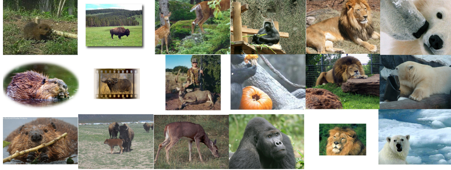
Fig. 3: Some examples of the six selected classes of AWA.

For the boosting-based methods, we used 1-level decision trees (stumps) as weak learners and they were run for 100 iterations; for Carako, the depth of the trees was limited to 10. The MKL were learnt with gaussian kernels on each view (same parameters: mean=8, width=2), with a regularized L1 norm and the regularization parameter C = 1. , and \epsilon = 0.001 .